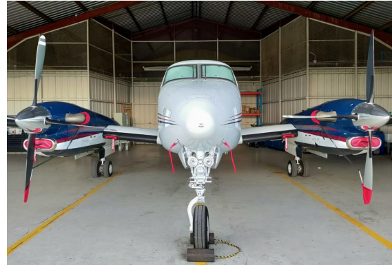
Beech King Air Prop Tie-Downs/Exhaust Covers