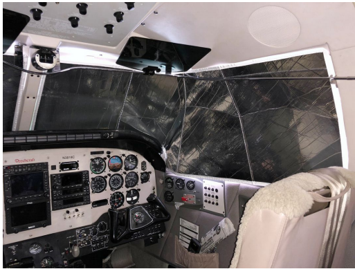
Beech King Air 90 & 100 (U-21, RU-21, T-44) Cockpit Heatshields

Cockpit Heatshields are interior sunshades for the aircraft's cockpit. The product is a unique composite of closed-cell foam with a silver mylar finish. The semi-rigid design is stiff enough to stand inside the window framing. The set folds up flat and is easily stored in the included storage sleeve. Some designs may require velcro and suction cups. A Heatshield is an excellent short-term remedy for cockpit overheating, but an external fabric cover is more effective for long-term protection.