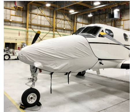
King Air 200 Nose Cover