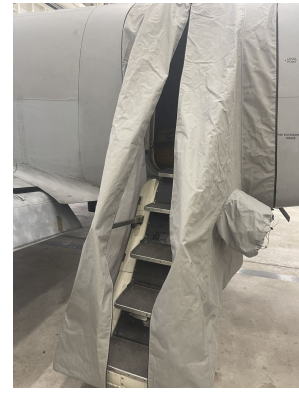
King Air Airstair Door Cover