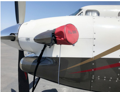
Beech King Air 350 Prop Tie-Downs/Exhaust Covers Combination

This cover type is made from Silver Acrylic Sunbrella canvas and is 100% lined with a soft and smooth microfiber. Bruce's Custom Covers developed this material combination especially for aircraft protection. The outer material is medium weight and treated for water resistance, UV resistance and anti-static buildup. The inner lining is a very soft and smooth microfiber to prevent scratching. The material is very reflective, and tests show that the cabin interior temperature can be reduced to near-ambient temperature on the hottest of days. It is water, ice and snow repellent, yet breathable to allow moisture to escape from between the cover and the aircraft surface.