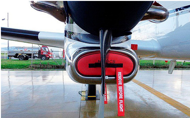
Beech King Air C90B Main Engine Inlet Plug

Engine Inlet Plugs are custom fit for your Beech King Air C90-1 intakes, made with heavy-duty vinyl material, and stuffed with a single block of sculpted urethane foam. Each plug has a zipper that allows the foam to be removed and dried if necessary. Engine plugs have warning flags that are visible from the cockpit or 'remove before flight' streamers sewn onto the face of the plugs. Most plugs are imprinted with the aircraft registration number in black for an extra charge. Storage bag NOT included. Engine plugs may be inserted after flight when the engine is still warm. Engine Inlet Plugs are commonly referred to as Cowl Plugs, Intake Plugs, Cowl Blocks, Engine Blocks, and Engine Bungs.