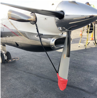
Beech King Air 350 Prop Tie-Downs

This cover type is made from Silver Acrylic Sunbrella canvas and is 100% lined with a soft and smooth microfiber. Bruce's Custom Covers developed this material combination especially for aircraft protection. The outer material is medium weight and treated for water resistance, UV resistance and anti-static buildup. The inner lining is a very soft and smooth microfiber to prevent scratching. The material is very reflective, and tests show that the cabin interior temperature can be reduced to near-ambient temperature on the hottest of days. It is water, ice and snow repellent, yet breathable to allow moisture to escape from between the cover and the aircraft surface.