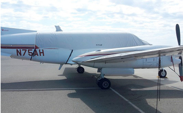
King Air 350 Canopy Cover

Travel Covers are made with Silver Solution-Dyed Polyester fabric and only lined over the windshield to save weight. The material is lightweight and more compact for easy stowage in the aircraft. The polyester material is water resistant, but only intended for occasional use outside. We also have an ultra lightweight material available for fitted hangar dust covers. For daily outdoor use, the non-travel Sunbrella Cover is the best choice.