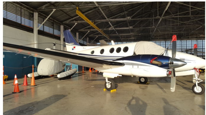
Raytheon Beech King Air Cockpit Cover, Prop Tie/Exhaust Covers, Inlet Plugs