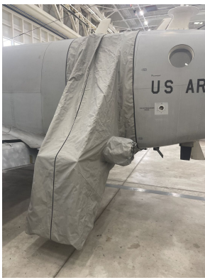
King Air Airstair Coor Cover