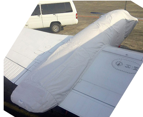
King Air 350 Engine Cover