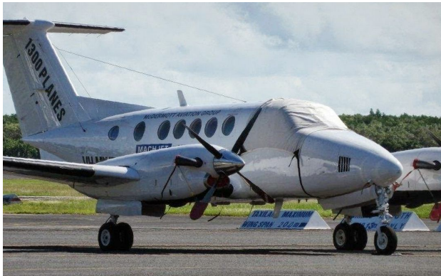
King Air 200

This cover type is made from Silver Acrylic Sunbrella canvas and is 100% lined with a soft and smooth microfiber. Bruce's Custom Covers developed this material combination especially for aircraft protection. The outer material is medium weight and treated for water resistance, UV resistance and anti-static buildup. The inner lining is a very soft and smooth microfiber to prevent scratching. The material is very reflective, and tests show that the cabin interior temperature can be reduced to near-ambient temperature on the hottest of days. It is water, ice and snow repellent, yet breathable to allow moisture to escape from between the cover and the aircraft surface.