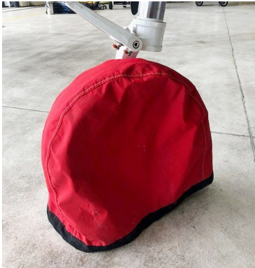
Beech King Air 300 Tire Covers (nose gear)

ALL-YEAR USE MATERIAL - Made with Silver Acrylic Sunbrella canvas, the all-year use material is the best option for sun protection and cover longevity. This heavier more durable material is intended for all weather conditions, such as rain and snow or lots of sun.