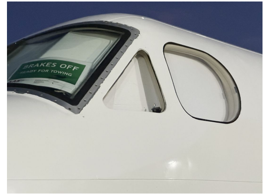
Beechcraft B200 Cockpit Heatshields