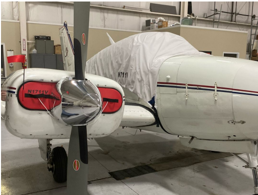
Beech Travel Air Engine Plugs

Engine Inlet Plugs are custom fit for your Beech Travel Air B95 intakes, made with heavy-duty vinyl material, and stuffed with a single block of sculpted urethane foam. Each plug has a zipper that allows the foam to be removed and dried if necessary. Engine plugs have warning flags that are visible from the cockpit or 'remove before flight' streamers sewn onto the face of the plugs. Most plugs are imprinted with the aircraft registration number in black for an extra charge. Storage bag NOT included. Engine plugs may be inserted after flight when the engine is still warm. Engine Inlet Plugs are commonly referred to as Cowl Plugs, Intake Plugs, Cowl Blocks, Engine Blocks, and Engine Bung. s.