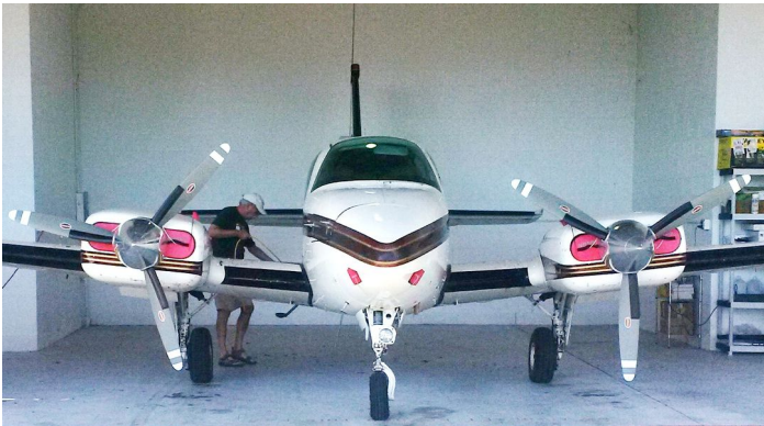
Beech Baron 58 Engine Inlet Plugs, Heater Inlet Plugs