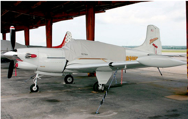
Beech B95 Travel Air Canopy Cover (Turbine Model)