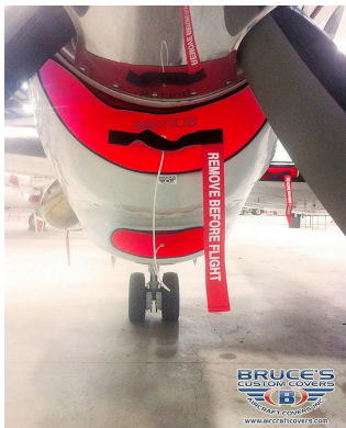
Engine and Oil Cooler Inlet Plugs

Engine Inlet Plugs are custom fit for your Beech 99 Airliner intakes, made with heavy-duty vinyl material, and stuffed with a single block of sculpted urethane foam. Each plug has a zipper that allows the foam to be removed and dried if necessary. Engine plugs have warning flags that are visible from the cockpit or 'remove before flight' streamers sewn onto the face of the plugs. Most plugs are imprinted with the aircraft registration number in black for an extra charge. Storage bag NOT included. Engine plugs may be inserted after flight when the engine is still warm. Engine Inlet Plugs are commonly referred to as Cowl Plugs, Intake Plugs, Cowl Blocks, Engine Blocks, and Engine Bungs.