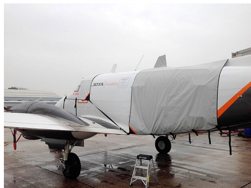
King Air Cargo/Jump Door Rain Cover