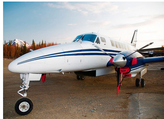
Beech 99 Engine Plugs & Prop Ties