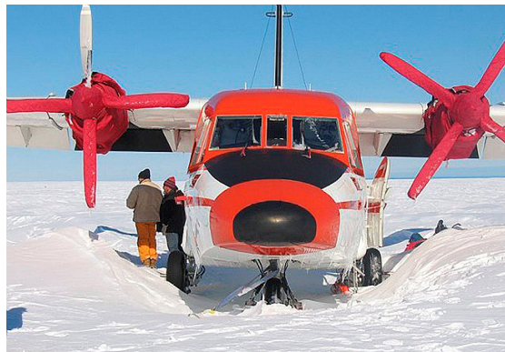
Casa 212 Insulated Engine & Propeller/Spinner Covers