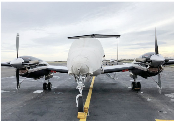
King Air 200 Canopy/Nose Cover

This cover type is made from Silver Acrylic Sunbrella canvas and is 100% lined with a soft and smooth microfiber. Bruce's Custom Covers developed this material combination especially for aircraft protection. The outer material is medium weight and treated for water resistance, UV resistance and anti-static buildup. The inner lining is a very soft and smooth microfiber to prevent scratching. The material is very reflective, and tests show that the cabin interior temperature can be reduced to near-ambient temperature on the hottest of days. It is water, ice and snow repellent, yet breathable to allow moisture to escape from between the cover and the aircraft surface.