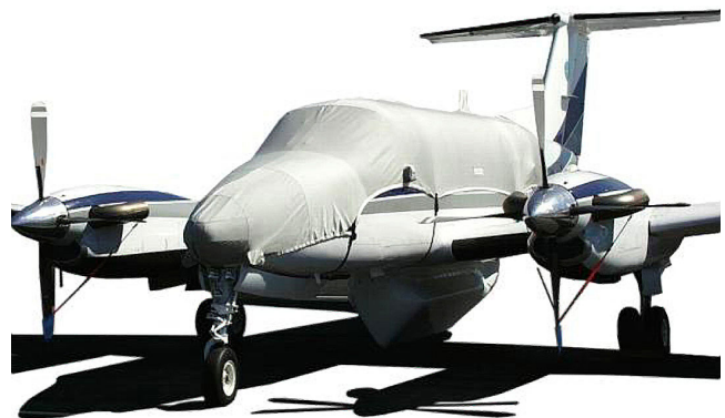
King Air Canopy/Nose Cover