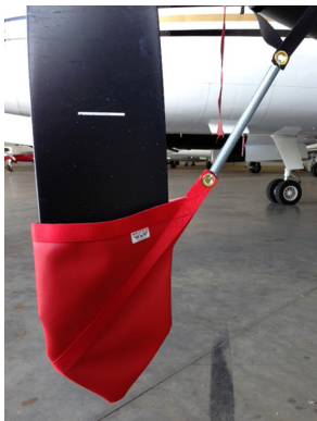
King Air Prop Tie

This cover type is made from Silver Acrylic Sunbrella canvas and is 100% lined with a soft and smooth microfiber. Bruce's Custom Covers developed this material combination especially for aircraft protection. The outer material is medium weight and treated for water resistance, UV resistance and anti-static buildup. The inner lining is a very soft and smooth microfiber to prevent scratching. The material is very reflective, and tests show that the cabin interior temperature can be reduced to near-ambient temperature on the hottest of days. It is water, ice and snow repellent, yet breathable to allow moisture to escape from between the cover and the aircraft surface.