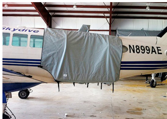
750XL Jump Door Cover