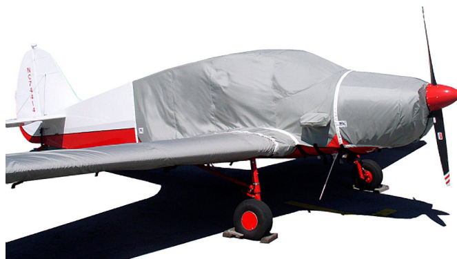
Bellanca Cruisemaster Insulated Engine Cover