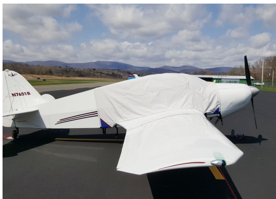
Bellanca Cruisemaster Extended Canopy Cover with 36" Wing Extensions.

This cover type is made from Silver Acrylic Sunbrella canvas and is 100% lined with a soft and smooth microfiber. Bruce's Custom Covers developed this material combination especially for aircraft protection. The outer material is medium weight and treated for water resistance, UV resistance and anti-static buildup. The inner lining is a very soft and smooth microfiber to prevent scratching. The material is very reflective, and tests show that the cabin interior temperature can be reduced to near-ambient temperature on the hottest of days. It is water, ice and snow repellent, yet breathable to allow moisture to escape from between the cover and the aircraft surface.