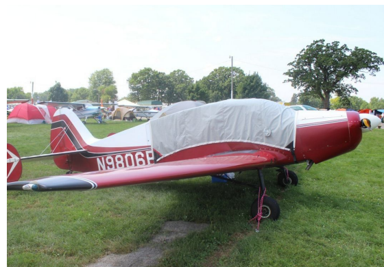
Bellanca Cruisemaster Canopy Cover