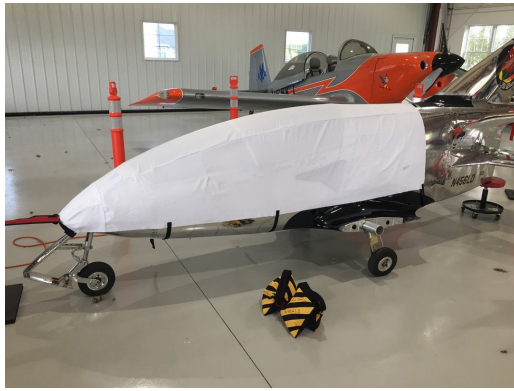
Bede BD-5 Canopy/Nose Cover, test fit cover