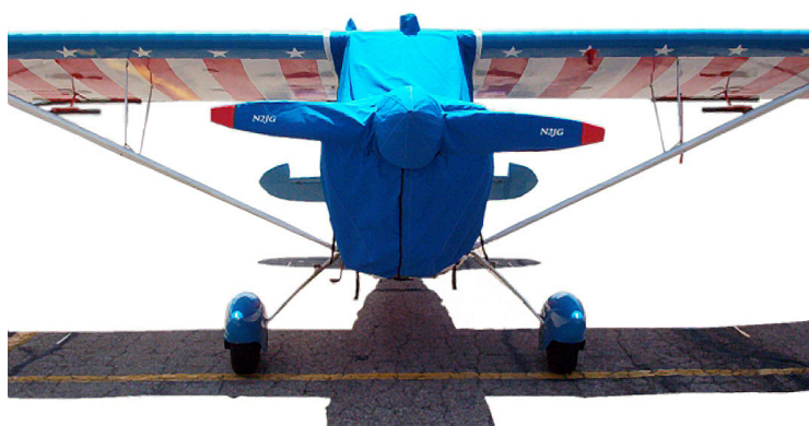
Bellanca Citabria Propellor & Engine Covers