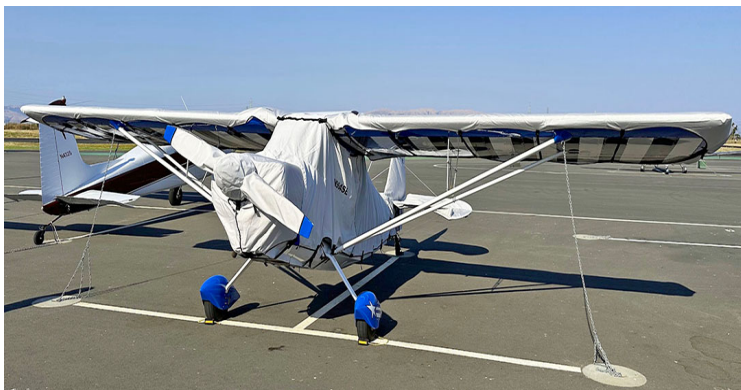
Bellanca Decathlon Cover Set