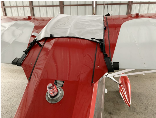
Bellanca Citabria Windshield/Skylight Cover

This cover type is made from Silver Acrylic Sunbrella canvas and is 100% lined with a soft and smooth microfiber. Bruce's Custom Covers developed this material combination especially for aircraft protection. The outer material is medium weight and treated for water resistance, UV resistance and anti-static buildup. The inner lining is a very soft and smooth microfiber to prevent scratching. The material is very reflective, and tests show that the cabin interior temperature can be reduced to near-ambient temperature on the hottest of days. It is water, ice and snow repellent, yet breathable to allow moisture to escape from between the cover and the aircraft surface.