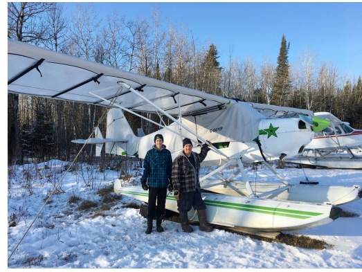
Bellanca Citabria Canopy Cover (extends to tail), Wing Covers, Empennage Covers