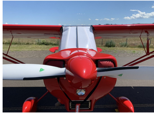
Bellanca Decathlon 8KCAB Heatshield Set with white side out