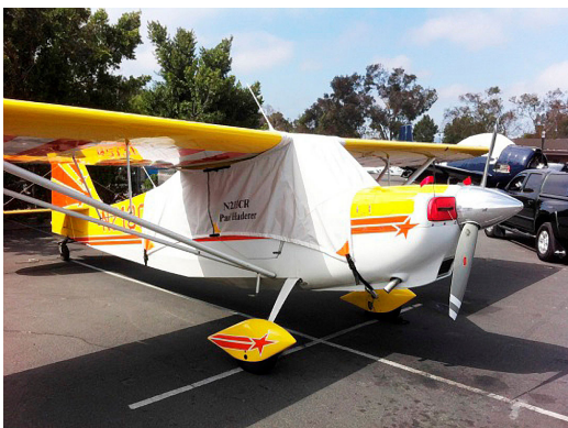
Bellanca Citabria Over-Top Canopy Cover

This cover type is made from Silver Acrylic Sunbrella canvas and is 100% lined with a soft and smooth microfiber. Bruce's Custom Covers developed this material combination especially for aircraft protection. The outer material is medium weight and treated for water resistance, UV resistance and anti-static buildup. The inner lining is a very soft and smooth microfiber to prevent scratching. The material is very reflective, and tests show that the cabin interior temperature can be reduced to near-ambient temperature on the hottest of days. It is water, ice and snow repellent, yet breathable to allow moisture to escape from between the cover and the aircraft surface.