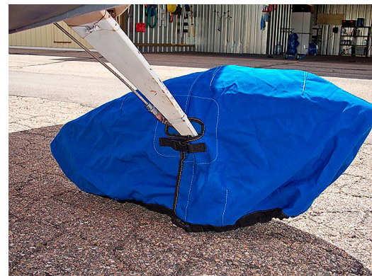
Bellanca Citabria Wheelpant Cover