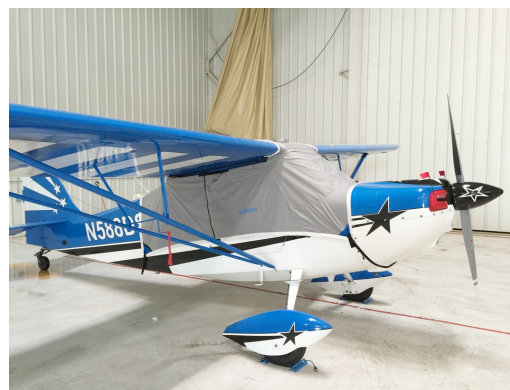
Bellanca Citabria Light Weight Travel Cover, Engine Plugs