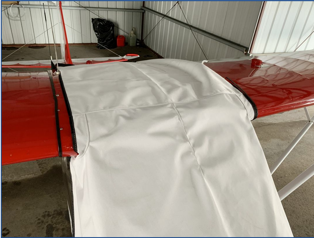
Bellanca Citabria Windshield/Skylight Cover