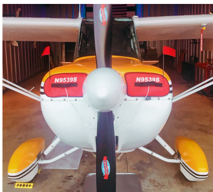
Bellanca Citabria 7ECA Engine Inlet Plugs

Engine Inlet Plugs are custom fit for your Bellanca (American Champion) Decathlon intakes, made with heavy-duty vinyl material, and stuffed with a single block of sculpted urethane foam. Each plug has a zipper that allows the foam to be removed and dried if necessary. Engine plugs have warning flags that are visible from the cockpit or 'remove before flight' streamers sewn onto the face of the plugs. Most plugs are imprinted with the aircraft registration number in black for an extra charge. Storage bag NOT included. Engine plugs may be inserted after flight when the engine is still warm. Engine Inlet Plugs are commonly referred to as Cowl Plugs, Intake Plugs, Cowl Blocks, Engine Blocks, and Engine Bungs.