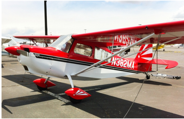
Bellanca Decathlon HeatShield Set

foam with a silver mylar finish. The semi-rigid design is stiff enough to stand along the inside of the windshield using sun visors or window framing. It folds up flat and easily stores in the included storage sleeve. Some designs may require velcro and suction cups or split right and left sides. A Heatshield is an excellent short-term remedy for cockpit overheating. An external fabric cover is far more effective and practical for long-term protection.