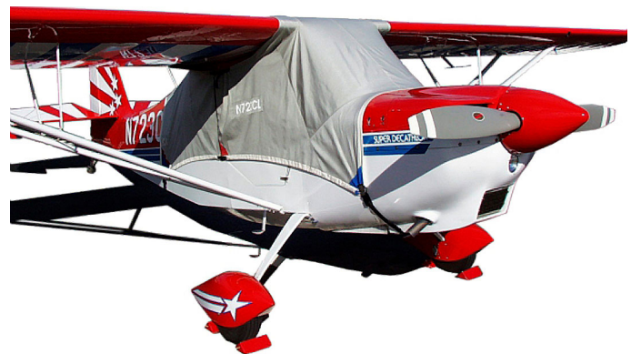
Bellanca Decathlon Over-the-Top Canopy Cover