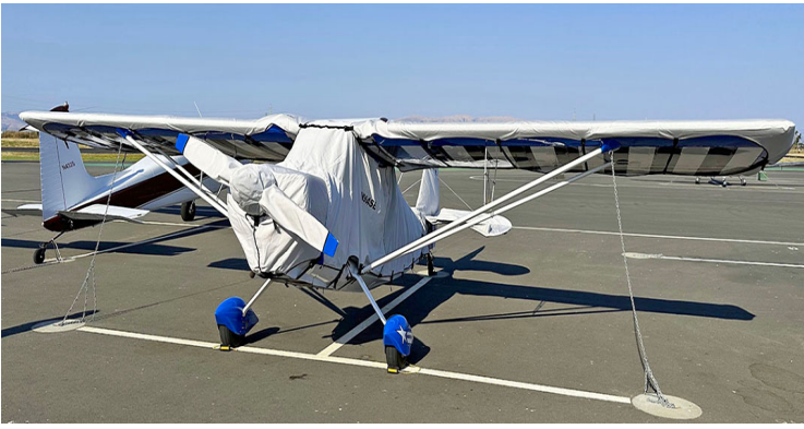
Bellanca Decathlon Cover Set