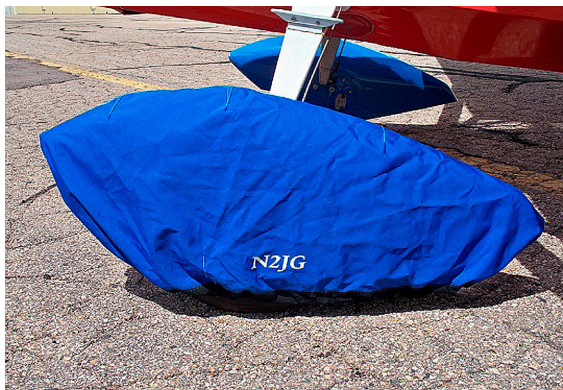
Bellanca Citabria Wheelpant Cover

ALL-YEAR USE MATERIAL - Made with Silver Acrylic Sunbrella canvas, the all-year use material is the best option for sun protection and cover longevity. This heavier more durable material is intended for all weather conditions, such as rain and snow or lots of sun.