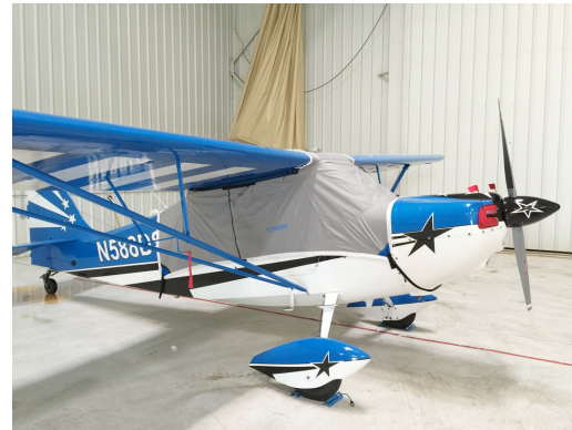
Bellanca Citabria Light Weight Travel Cover, Engine Plugs