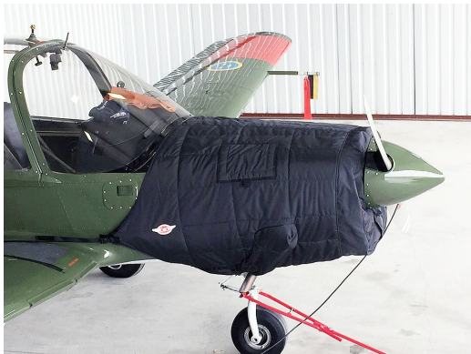
Scottish Aviation Bulldog Insulated Engine Cover

This cover type is made from Silver Acrylic Sunbrella canvas and is 100% lined with a soft and smooth microfiber. Bruce's Custom Covers developed this material combination especially for aircraft protection. The outer material is medium weight and treated for water resistance, UV resistance and anti-static buildup. The inner lining is a very soft and smooth microfiber to prevent scratching. The material is very reflective, and tests show that the cabin interior temperature can be reduced to near-ambient temperature on the hottest of days. It is water, ice and snow repellent, yet breathable to allow moisture to escape from between the cover and the aircraft surface.