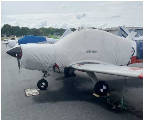
Scottish Aviation Bulldog Canopy & Engine Covers