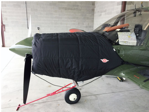
Scottish Aviation Bulldog Insulated Engine Cover