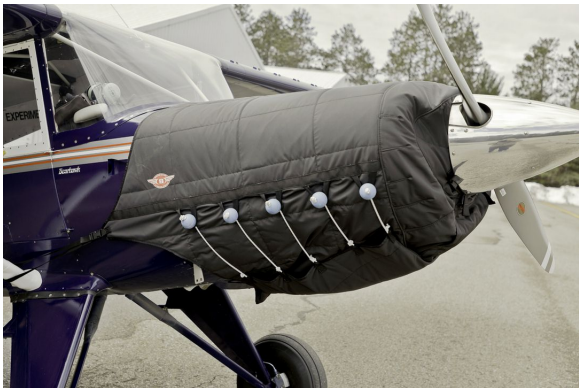
Bearhawk Insulated Engine Cover

This cover type is made from Silver Acrylic Sunbrella canvas and is 100% lined with a soft and smooth microfiber. Bruce's Custom Covers developed this material combination especially for aircraft protection. The outer material is medium weight and treated for water resistance, UV resistance and anti-static buildup. The inner lining is a very soft and smooth microfiber to prevent scratching. The material is very reflective, and tests show that the cabin interior temperature can be reduced to near-ambient temperature on the hottest of days. It is water, ice and snow repellent, yet breathable to allow moisture to escape from between the cover and the aircraft surface.