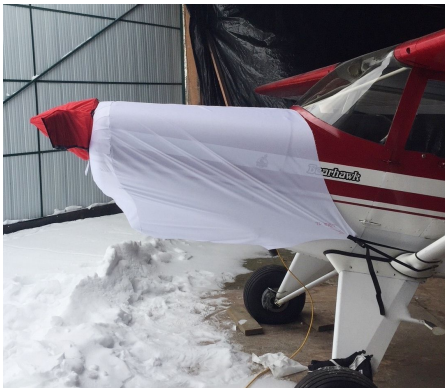
Bearhawk Engine Cover (test fit), Insulated Prop Cover