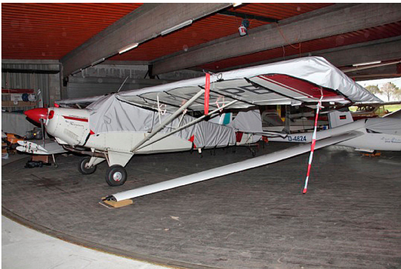
Aviat Husky Engine Plugs, Canopy, Wing & Empennage Covers