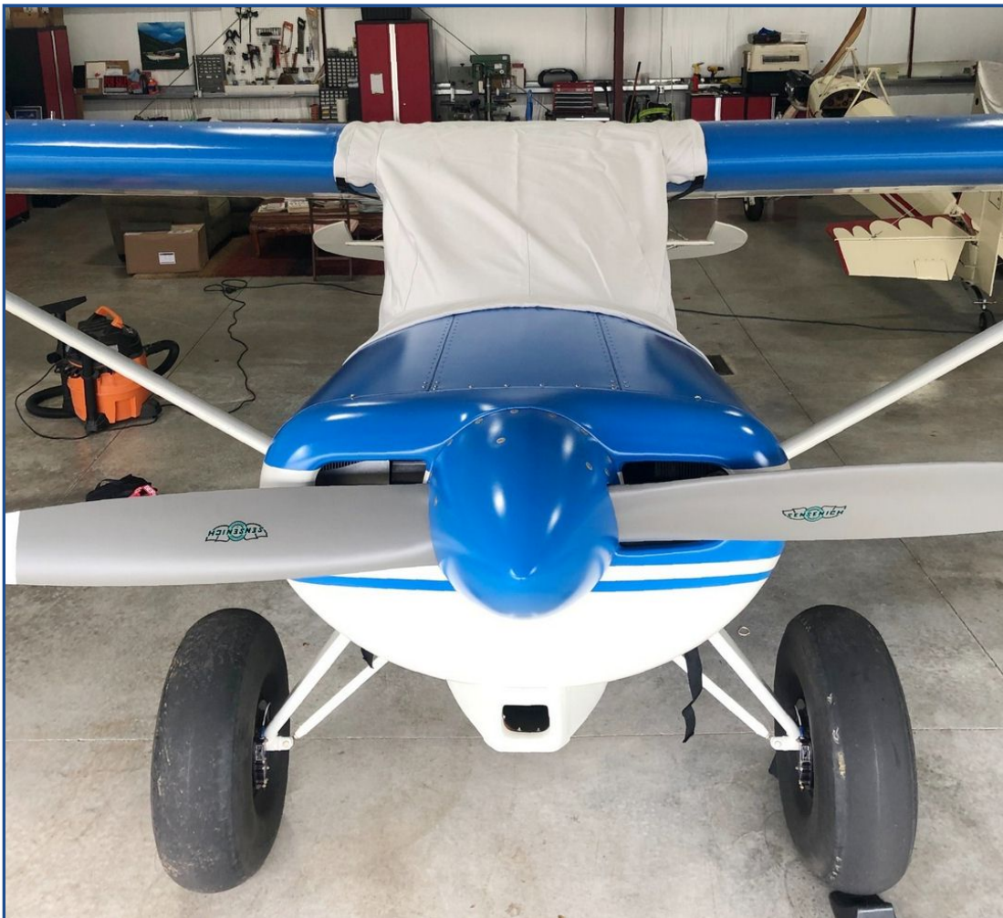
Bearhawk 2-Place Model Canopy Cover