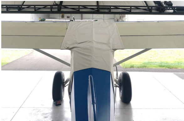
Bearhawk 2-Place Model Canopy Cover