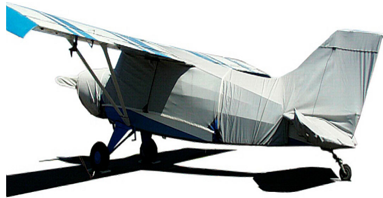
Maule Empennage, Engine & Prop Covers

WINTER USE MATERIAL - Made with Solution-Dyed Polyester fabric, this option is intended for seasonal use to aid in deicing, rain mitigation, or for occasional travel. The material is lighter and more compact, but more susceptible to UV damage and may have a shorter useful life if used continuously outside than the all-year use material.