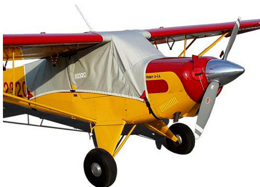
Aviat Husky Canopy Cover & Engine Plugs

Engine Inlet Plugs are custom fit for your Bearhawk Patrol Model (2 Place) intakes, made with heavy-duty vinyl material, and stuffed with a single block of sculpted urethane foam. Each plug has a zipper that allows the foam to be removed and dried if necessary. Engine plugs have warning flags that are visible from the cockpit or 'remove before flight' streamers sewn onto the face of the plugs. Most plugs are imprinted with the aircraft registration number in black for an extra charge. Storage bag NOT included. Engine plugs may be inserted after flight when the engine is still warm. Engine Inlet Plugs are commonly referred to as Cowl Plugs, Intake Plugs, Cowl Blocks, Engine Blocks, and Engine Bungs.