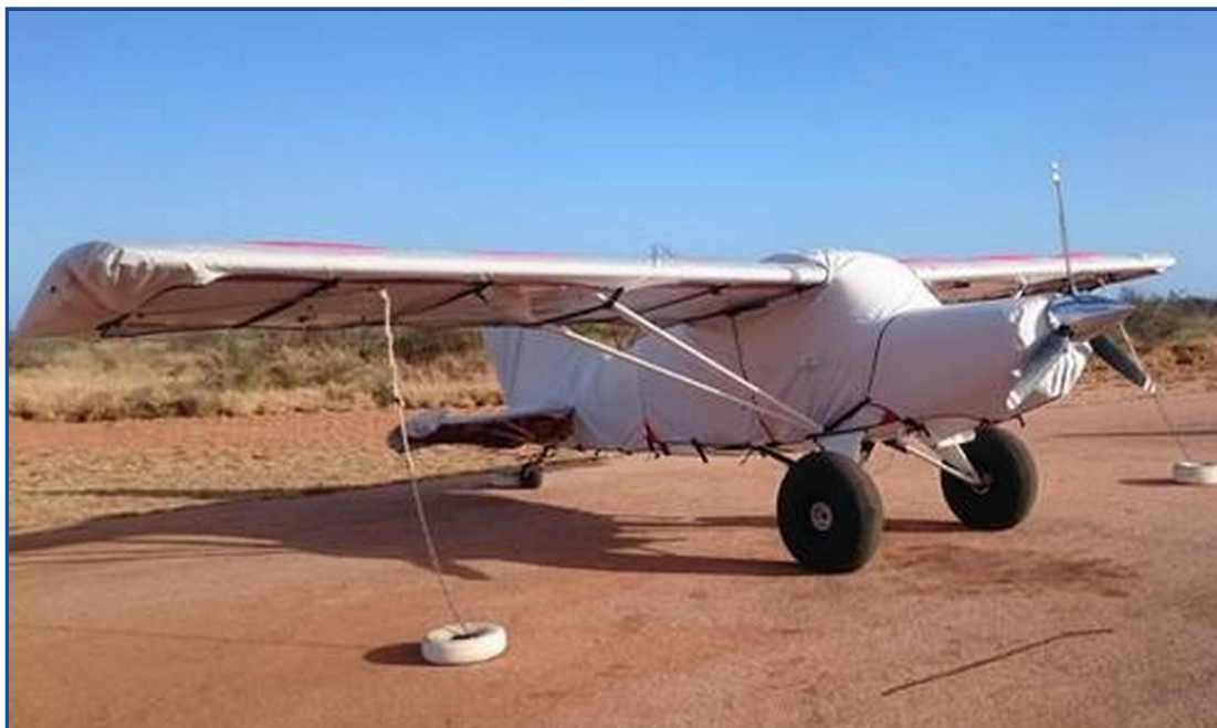
Maule M7-235 Extended Canopy, Wing, Engine &amp; Empennage Covers