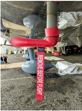
Van's RV-14 Pitot Cover

Engine Inlet Plugs are custom fit for your Bearhawk 4-Place & 5-Place Models intakes, made with heavy-duty vinyl material, and stuffed with a single block of sculpted urethane foam. Each plug has a zipper that allows the foam to be removed and dried if necessary. Engine plugs have warning flags that are visible from the cockpit or 'remove before flight' streamers sewn onto the face of the plugs. Most plugs are imprinted with the aircraft registration number in black for an extra charge. Storage bag NOT included. Engine plugs may be inserted after flight when the engine is still warm. Engine Inlet Plugs are commonly referred to as Cowl Plugs, Intake Plugs, Cowl Blocks, Engine Blocks, and Engine Bungs.