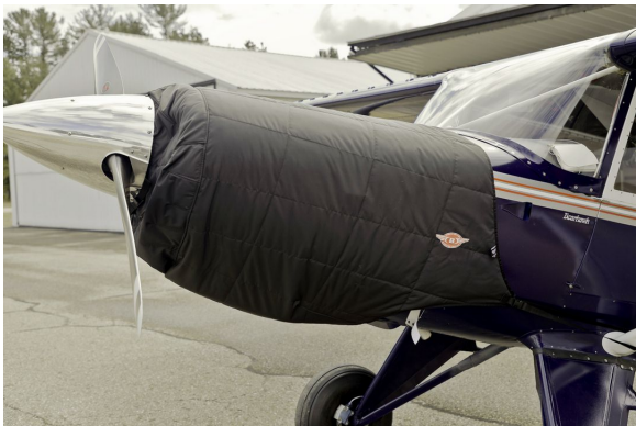
Bearhawk Insulated Engine Cover

This cover type is made from Silver Acrylic Sunbrella canvas and is 100% lined with a soft and smooth microfiber. Bruce's Custom Covers developed this material combination especially for aircraft protection. The outer material is medium weight and treated for water resistance, UV resistance and anti-static buildup. The inner lining is a very soft and smooth microfiber to prevent scratching. The material is very reflective, and tests show that the cabin interior temperature can be reduced to near-ambient temperature on the hottest of days. It is water, ice and snow repellent, yet breathable to allow moisture to escape from between the cover and the aircraft surface.