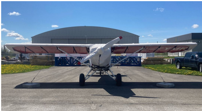
Bearhawk 4-Place Complete Cover Set