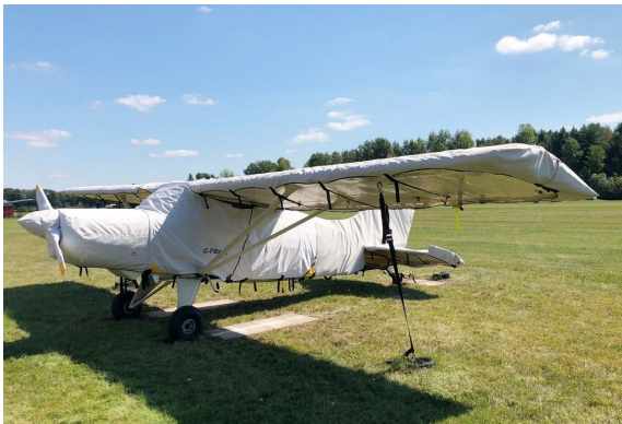
Maule Complete Cover Set