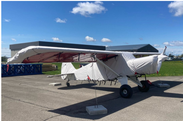
Bearhawk 4-Place Complete Cover Set, AFTER