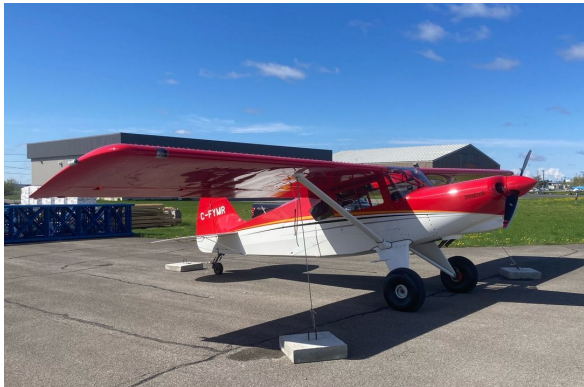
Bearhawk 4-Place Complete Cover Set, BEFORE

WINTER USE MATERIAL - Made with Solution-Dyed Polyester fabric, this option is intended for seasonal use to aid in deicing, rain mitigation, or for occasional travel. The material is lighter and more compact, but more susceptible to UV damage and may have a shorter useful life if used continuously outside than the all-year use material.