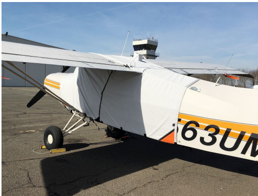
Maule M-5-235C Extended Canopy Cover

This cover type is made from Silver Acrylic Sunbrella canvas and is 100% lined with a soft and smooth microfiber. Bruce's Custom Covers developed this material combination especially for aircraft protection. The outer material is medium weight and treated for water resistance, UV resistance and anti-static buildup. The inner lining is a very soft and smooth microfiber to prevent scratching. The material is very reflective, and tests show that the cabin interior temperature can be reduced to near-ambient temperature on the hottest of days. It is water, ice and snow repellent, yet breathable to allow moisture to escape from between the cover and the aircraft surface.