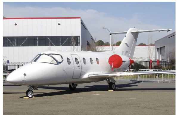
Beechjet Engine Covers, Cockpit HeatShields