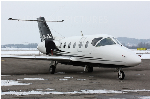
Nextant 400XTi Bikini Type Engine Covers

The Hawker Beechcraft Beechjet 400, Hawker 400XP (T1A, T400 Jayhawk) Intake Covers are designed to install easily yet be completely storable. A spring steel hoop is sewn into the hem of each cover, allowing them to be installed without climbing onto the wing or using a stepladder. To store the covers the spring steel hoop folds like a band-saw blade into three nesting rings. Each cover folds into a compact circular bundle which is stored in the included duffle bag, yet they unfold quickly for use. The Tri-Fold Ring cover is made of medium weight nylon which is available in a variety of colors to match the paint trim. Each cover set comes complete with installation and folding instructions. The aircraft's registration number can be silkscreened onto the cover for an extra charge.