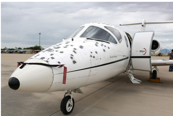
Raytheon Beechjet Hail Damage, and Pitot Covers

This cover type is made from Silver Acrylic Sunbrella canvas and is 100% lined with a soft and smooth microfiber. Bruce's Custom Covers developed this material combination especially for aircraft protection. The outer material is medium weight and treated for water resistance, UV resistance and anti-static buildup. The inner lining is a very soft and smooth microfiber to prevent scratching. The material is very reflective, and tests show that the cabin interior temperature can be reduced to near-ambient temperature on the hottest of days. It is water, ice and snow repellent, yet breathable to allow moisture to escape from between the cover and the aircraft surface.