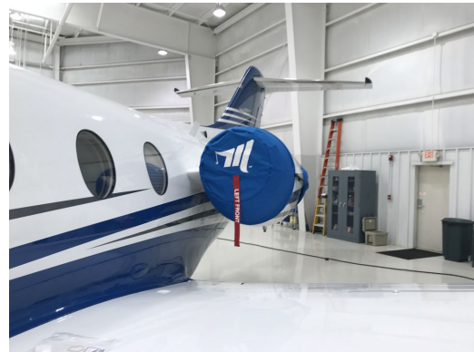
Raytheon 400A Engine Covers