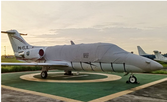
Beechjet Fuselage/Nose Cover

This cover type is made from Silver Acrylic Sunbrella canvas and is 100% lined with a soft and smooth microfiber. Bruce's Custom Covers developed this material combination especially for aircraft protection. The outer material is medium weight and treated for water resistance, UV resistance and anti-static buildup. The inner lining is a very soft and smooth microfiber to prevent scratching. The material is very reflective, and tests show that the cabin interior temperature can be reduced to near-ambient temperature on the hottest of days. It is water, ice and snow repellent, yet breathable to allow moisture to escape from between the cover and the aircraft surface.