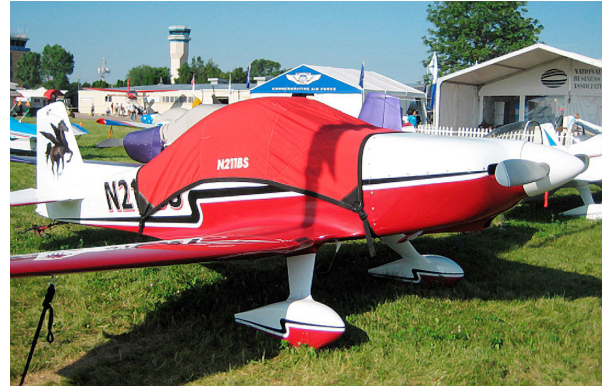
Bushby Mustang Canopy Cover