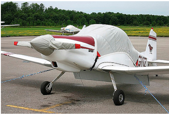
Bushby Mustang Canopy cover and Propellor/Spinner cover

This cover type is made from Silver Acrylic Sunbrella canvas and is 100% lined with a soft and smooth microfiber. Bruce's Custom Covers developed this material combination especially for aircraft protection. The outer material is medium weight and treated for water resistance, UV resistance and anti-static buildup. The inner lining is a very soft and smooth microfiber to prevent scratching. The material is very reflective, and tests show that the cabin interior temperature can be reduced to near-ambient temperature on the hottest of days. It is water, ice and snow repellent, yet breathable to allow moisture to escape from between the cover and the aircraft surface.