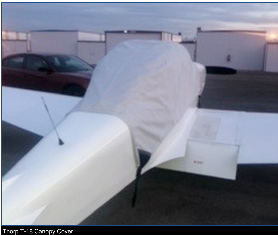
Thorp T-18 Canopy Cover