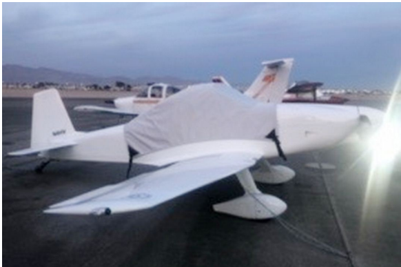
Thorp T-18 Canopy Cover