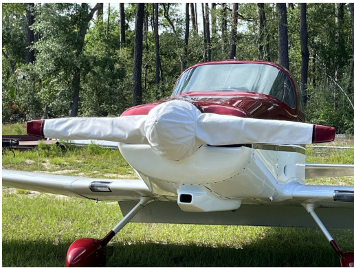
Mustang 2 Prop/Spinner Cover