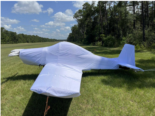
Thorp T-18 & Bushby Mustang Complete Cover, test fit cover

This cover type is made from Silver Acrylic Sunbrella canvas and is 100% lined with a soft and smooth microfiber. Bruce's Custom Covers developed this material combination especially for aircraft protection. The outer material is medium weight and treated for water resistance, UV resistance and anti-static buildup. The inner lining is a very soft and smooth microfiber to prevent scratching. The material is very reflective, and tests show that the cabin interior temperature can be reduced to near-ambient temperature on the hottest of days. It is water, ice and snow repellent, yet breathable to allow moisture to escape from between the cover and the aircraft surface.