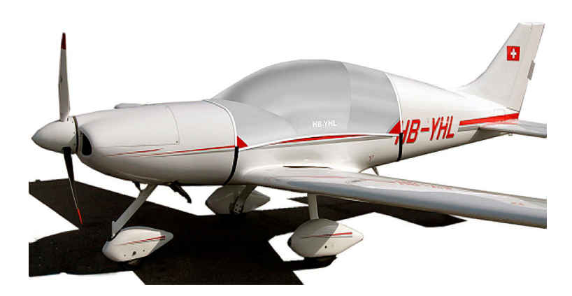
Pulsar Canopy Cover (illustration)