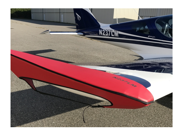
BRM Aero Bristell S-LSA Wingtip Pads