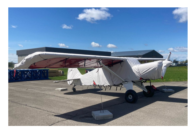
Bearhawk 4-Place Complete Cover Set, AFTER

WINTER USE MATERIAL - Made with Solution-Dyed Polyester fabric, this option is intended for seasonal use to aid in deicing, rain mitigation, or for occasional travel. The material is lighter and more compact, but more susceptible to UV damage and may have a shorter useful life if used continuously outside than the all-year use material.