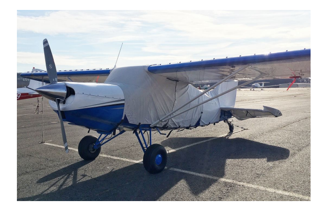
Maule M-5-235C Extended Canopy Cover, Empennage Cover

This cover type is made from Silver Acrylic Sunbrella canvas and is 100% lined with a soft and smooth microfiber. Bruce's Custom Covers developed this material combination especially for aircraft protection. The outer material is medium weight and treated for water resistance, UV resistance and anti-static buildup. The inner lining is a very soft and smooth microfiber to prevent scratching. The material is very reflective, and tests show that the cabin interior temperature can be reduced to near-ambient temperature on the hottest of days. It is water, ice and snow repellent, yet breathable to allow moisture to escape from between the cover and the aircraft surface.