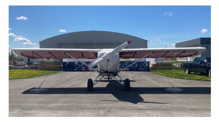
Bearhawk 4-Place Complete Cover Set

This cover type is made from Silver Acrylic Sunbrella canvas and is 100% lined with a soft and smooth microfiber. Bruce's Custom Covers developed this material combination especially for aircraft protection. The outer material is medium weight and treated for water resistance, UV resistance and anti-static buildup. The inner lining is a very soft and smooth microfiber to prevent scratching. The material is very reflective, and tests show that the cabin interior temperature can be reduced to near-ambient temperature on the hottest of days. It is water, ice and snow repellent, yet breathable to allow moisture to escape from between the cover and the aircraft surface.