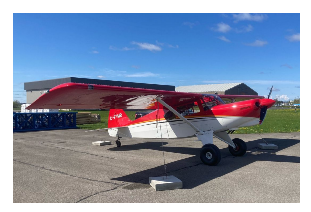
Bearhawk 4-Place Complete Cover Set, BEFORE