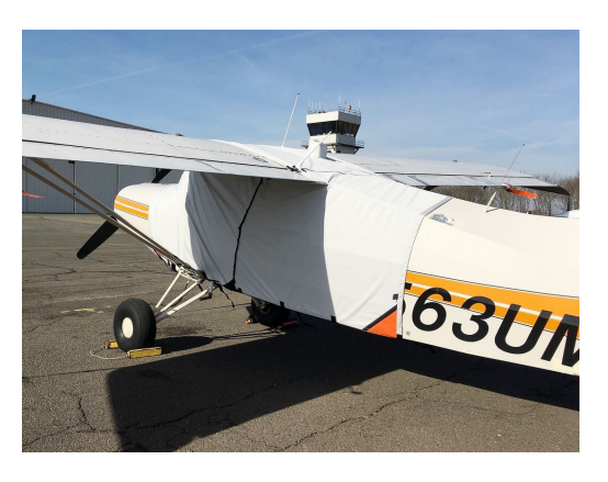
Maule M-5-235C Extended Canopy Cover