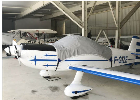
Mudry Cap 10 Travel Cover, Light Weight Travel Canopy Cover