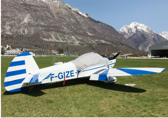
Mudry Cap 10 Canopy Cover

water resistance, UV resistance and anti-static buildup. The inner lining is a very soft and smooth microfiber to prevent scratching. The material is very reflective, and tests show that the cabin interior temperature can be reduced to near-ambient temperature on the hottest of days. It is water, ice and snow repellent, yet breathable to allow moisture to escape from between the cover and the aircraft surface.