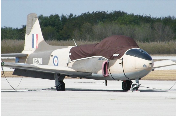
Jet Provost Canopy Cover

Travel Covers are made with Silver Solution-Dyed Polyester fabric and only lined over the windshield to save weight. The material is lightweight and more compact for easy stowage in the aircraft. The polyester material is water resistant, but only intended for occasional use outside. We also have an ultra lightweight material available for fitted hangar dust covers. For daily outdoor use, the non-travel Sunbrella Cover is the best choice.