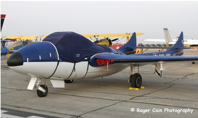
DeHavilland Vampire Canopy Cover, Engine Plugs