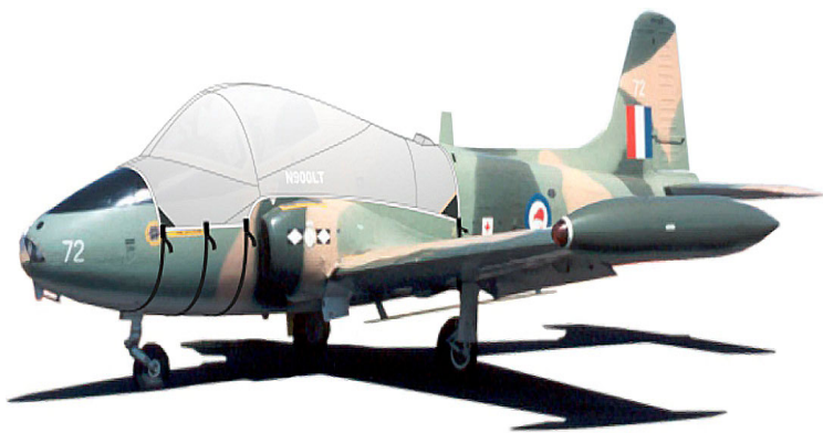
Jet Provost Canopy Cover (Illustration)

Travel Covers are made with Silver Solution-Dyed Polyester fabric and only lined over the windshield to save weight. The material is lightweight and more compact for easy stowage in the aircraft. The polyester material is water resistant, but only intended for occasional use outside. We also have an ultra lightweight material available for fitted hangar dust covers. For daily outdoor use, the non-travel Sunbrella Cover is the best choice.