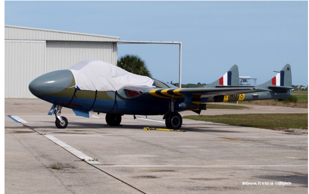
DeHavilland Vampire Canopy Cover