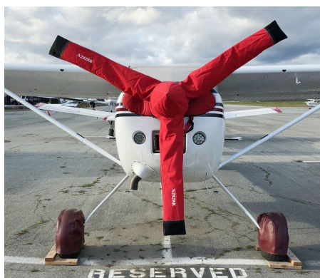
Cessna Skywagon Propellor/Spinner Cover, 3-blade type