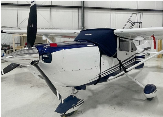
Cessna 182 Windshield Cover, Engine Plugs