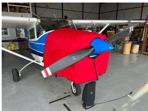
Insulated Hangar Blanket on Cessna 182

This cover type is made from Silver Acrylic Sunbrella canvas and is 100% lined with a soft and smooth microfiber. Bruce's Custom Covers developed this material combination especially for aircraft protection. The outer material is medium weight and treated for water resistance, UV resistance and anti-static buildup. The inner lining is a very soft and smooth microfiber to prevent scratching. The material is very reflective, and tests show that the cabin interior temperature can be reduced to near-ambient temperature on the hottest of days. It is water, ice and snow repellent, yet breathable to allow moisture to escape from between the cover and the aircraft surface.