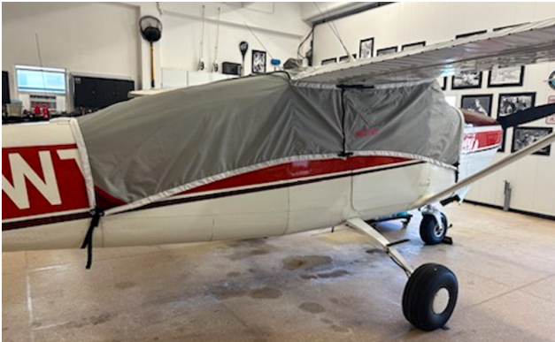
Cessna 205 Stationair Canopy Cover, Over Top Type

This cover type is made from Silver Acrylic Sunbrella canvas and is 100% lined with a soft and smooth microfiber. Bruce's Custom Covers developed this material combination especially for aircraft protection. The outer material is medium weight and treated for water resistance, UV resistance and anti-static buildup. The inner lining is a very soft and smooth microfiber to prevent scratching. The material is very reflective, and tests show that the cabin interior temperature can be reduced to near-ambient temperature on the hottest of days. It is water, ice and snow repellent, yet breathable to allow moisture to escape from between the cover and the aircraft surface.