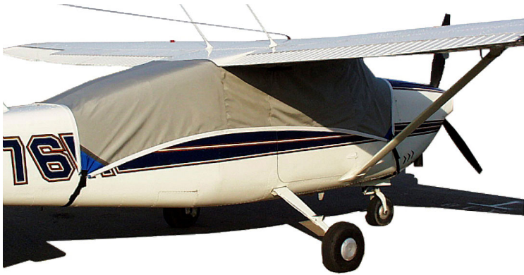
Cessna 206 Wrap-Around Canopy Cover