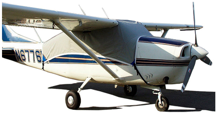
Canopy covers are available in belly strap, snap-on or Over-the-Top Styles