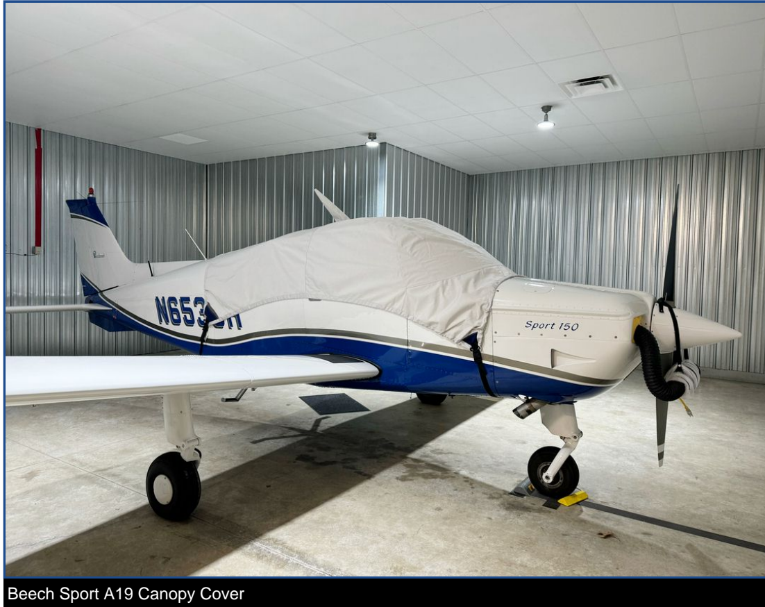
Beech Sport A19 Canopy Cover