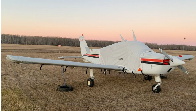
Sport B19 Engine Inlet Plugs

plugs have warning flags that are visible from the cockpit or 'remove before flight' streamers sewn onto the face of the plugs. Most plugs are imprinted with the aircraft registration number in black for an extra charge. Storage bag NOT included. Engine plugs may be inserted after flight when the engine is still warm. Engine Inlet Plugs are commonly referred to as Cowl Plugs, Intake Plugs, Cowl Blocks, Engine Blocks, and Engine Bungs.