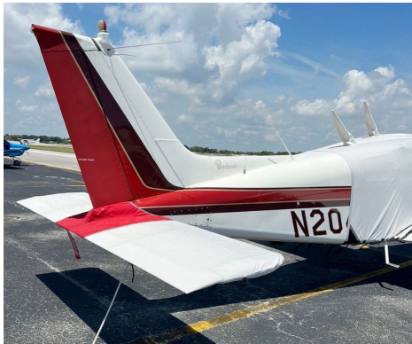
Beech C23 Sundowner Horizontal Stabilizer Covers, Tailcone Cover

WINTER USE MATERIAL - Made with Solution-Dyed Polyester fabric, this option is intended for seasonal use to aid in deicing, rain mitigation, or for occasional travel. The material is lighter and more compact, but more susceptible to UV damage and may have a shorter useful life if used continuously outside than the all-year use material.