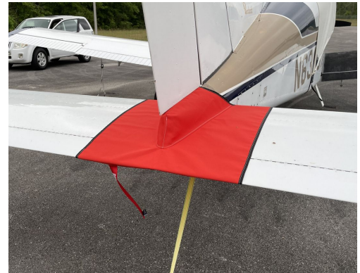
Beech C23 Tailcone Cover, Fully Enclosed