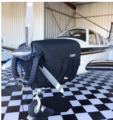
Beech Bonanza 36 Models Insulated Engine Cover

This cover type is made from Silver Acrylic Sunbrella canvas and is 100% lined with a soft and smooth microfiber. Bruce's Custom Covers developed this material combination especially for aircraft protection. The outer material is medium weight and treated for water resistance, UV resistance and anti-static buildup. The inner lining is a very soft and smooth microfiber to prevent scratching. The material is very reflective, and tests show that the cabin interior temperature can be reduced to near-ambient temperature on the hottest of days. It is water, ice and snow repellent, yet breathable to allow moisture to escape from between the cover and the aircraft surface.