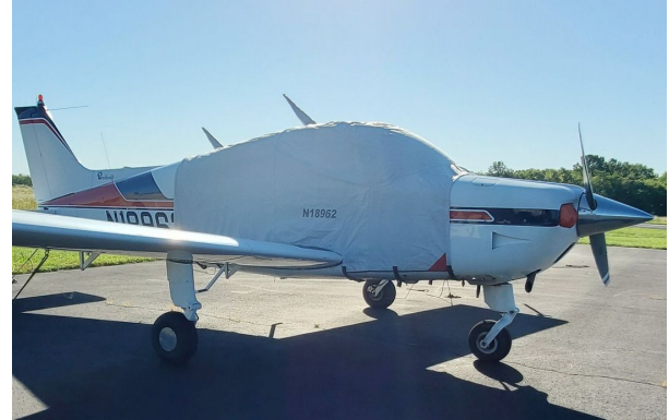
Beech C23 Sundowner Extended Canopy Cover