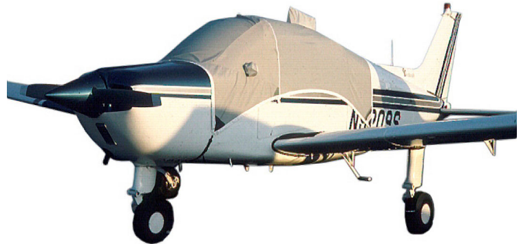
Beech Sport Canopy Cover