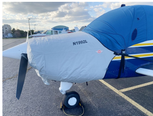
Beech C23 Sundowner Insulated Engine Cover