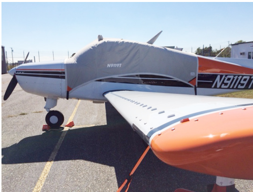
Beech Musketeer Canopy Cover

Travel Covers are made with Silver Solution-Dyed Polyester fabric and only lined over the windshield to save weight. The material is lightweight and more compact for easy stowage in the aircraft. The polyester material is water resistant, but only intended for occasional use outside. We also have an ultra lightweight material available for fitted hangar dust covers. For daily outdoor use, the non-travel Sunbrella Cover is the best choice.