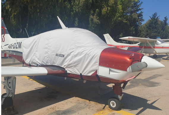
Beech Sierra Extended Canopy Cover

This cover type is made from Silver Acrylic Sunbrella canvas and is 100% lined with a soft and smooth microfiber. Bruce's Custom Covers developed this material combination especially for aircraft protection. The outer material is medium weight and treated for water resistance, UV resistance and anti-static buildup. The inner lining is a very soft and smooth microfiber to prevent scratching. The material is very reflective, and tests show that the cabin interior temperature can be reduced to near-ambient temperature on the hottest of days. It is water, ice and snow repellent, yet breathable to allow moisture to escape from between the cover and the aircraft surface.