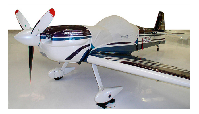
Canopy Cover for the Cap 232