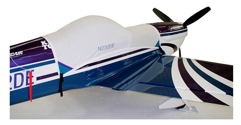
Cap 232 Canopy Cover

Travel Covers are made with Silver Solution-Dyed Polyester fabric and only lined over the windshield to save weight. The material is lightweight and more compact for easy stowage in the aircraft. The polyester material is water resistant, but only intended for occasional use outside. We also have an ultra lightweight material available for fitted hangar dust covers. For daily outdoor use, the non-travel Sunbrella Cover is the best choice.