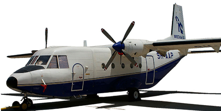
Casa 212 Engine Plugs

Engine Inlet Plugs are custom fit for your Casa/IPTN CN-235 intakes, made with heavy-duty vinyl material, and stuffed with a single block of sculpted urethane foam. Each plug has a zipper that allows the foam to be removed and dried if necessary. Engine plugs have warning flags that are visible from the cockpit or 'remove before flight' streamers sewn onto the face of the plugs. Most plugs are imprinted with the aircraft registration number in black for an extra charge. Storage bag NOT included. Engine plugs may be inserted after flight when the engine is still warm. Engine Inlet Plugs are commonly referred to as Cowl Plugs, Intake Plugs, Cowl Blocks, Engine Blocks, and Engine Bungs.