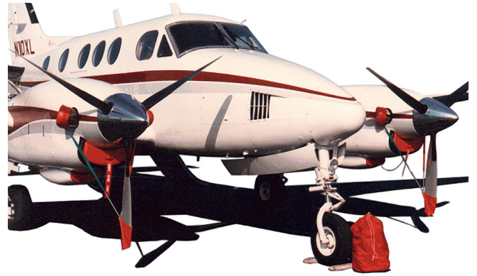
Pitot, Exhaust Covers, Engine Plugs & Prop Ties