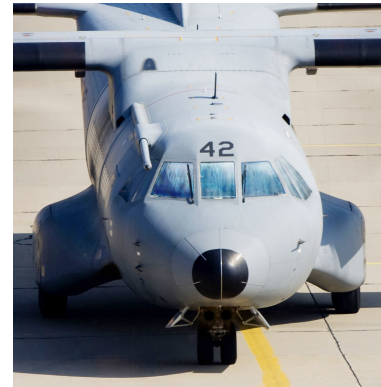
Casa C-295 Cockpit HeatShields (illustration)