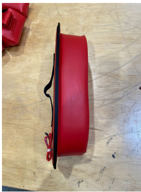
Canadair Challenger 300, 350 APU Exhaust Plug