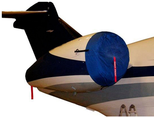
Challenger 300 Intake Covers (set of 2), come in colors