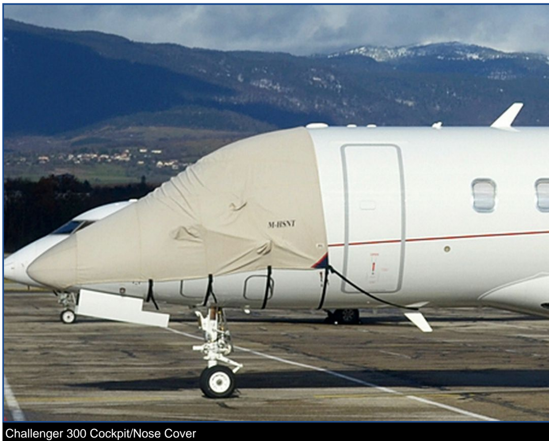
Challenger 300 Cockpit/Nose Cover