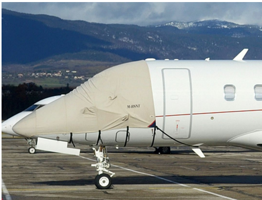
Challenger 300 Cockpit/Nose Cover

This cover type is made from Silver Acrylic Sunbrella canvas and is 100% lined with a soft and smooth microfiber. Bruce's Custom Covers developed this material combination especially for aircraft protection. The outer material is medium weight and treated for water resistance, UV resistance and anti-static buildup. The inner lining is a very soft and smooth microfiber to prevent scratching. The material is very reflective, and tests show that the cabin interior temperature can be reduced to near-ambient temperature on the hottest of days. It is water, ice and snow repellent, yet breathable to allow moisture to escape from between the cover and the aircraft surface.