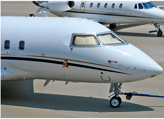
Challenger 604 Cockpit HeatShields