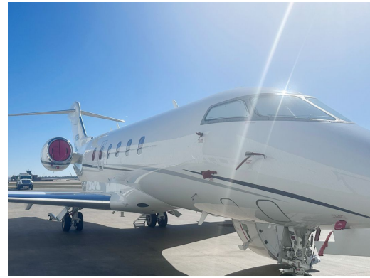
Canadair Challenger 300 Cockpit HeatShields, Intake Plugs