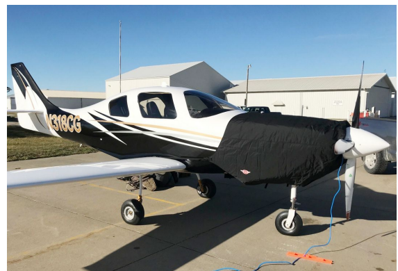
Lancair IV-P Insulated Engine Cover, fully enclosed