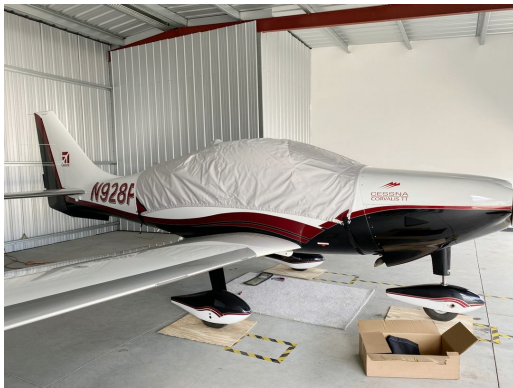
Corvalis TT 400 Canopy Cover

This cover type is made from Silver Acrylic Sunbrella canvas and is 100% lined with a soft and smooth microfiber. Bruce's Custom Covers developed this material combination especially for aircraft protection. The outer material is medium weight and treated for water resistance, UV resistance and anti-static buildup. The inner lining is a very soft and smooth microfiber to prevent scratching. The material is very reflective, and tests show that the cabin interior temperature can be reduced to near-ambient temperature on the hottest of days. It is water, ice and snow repellent, yet breathable to allow moisture to escape from between the cover and the aircraft surface.