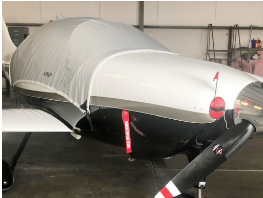
Columbia 350 Travel Cover, Engine Plugs

Travel Covers are made with Silver Solution-Dyed Polyester fabric and only lined over the windshield to save weight. The material is lightweight and more compact for easy stowage in the aircraft. The polyester material is water resistant, but only intended for occasional use outside. We also have an ultra lightweight material available for fitted hangar dust covers. For daily outdoor use, the non-travel Sunbrella Cover is the best choice.