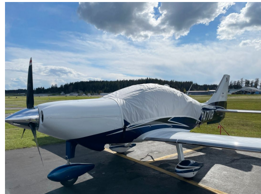
Textron T240 Canopy Cover