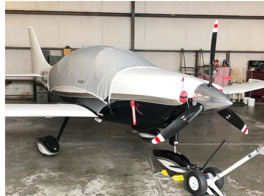
Columbia 350 Travel Cover, Engine Plugs