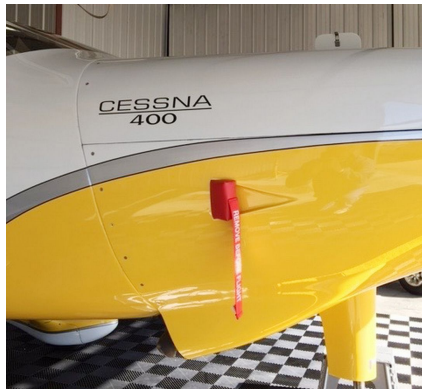
Cessna Corvalis, Corvalis TT, Models T240, 350 & 400 Fresh Air/Oat Vent Plug

Engine Inlet Plugs are custom fit for your Cessna Corvalis, Corvalis TT, Models T240, 350 & 400 intakes, made with heavy-duty vinyl material, and stuffed with a single block of sculpted urethane foam. Each plug has a zipper that allows the foam to be removed and dried if necessary. Engine plugs have warning flags that are visible from the cockpit or 'remove before flight' streamers sewn onto the face of the plugs. Most plugs are imprinted with the aircraft registration number in black for an extra charge. Storage bag NOT included. Engine plugs may be inserted after flight when the engine is still warm. Engine Inlet Plugs are commonly referred to as Cowl Plugs, Intake Plugs, Cowl Blocks, Engine Blocks, and Engine Bung s. Designed to prevent damage to the aircraft extremities in crowded hangars, these products are made of bright red Naugahyde and thickly padded with a sandwich of closed cell foam.