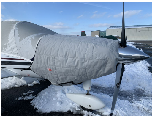
Cessna Corvallis Insulated Engine Cover

This cover type is made from Silver Acrylic Sunbrella canvas and is 100% lined with a soft and smooth microfiber. Bruce's Custom Covers developed this material combination especially for aircraft protection. The outer material is medium weight and treated for water resistance, UV resistance and anti-static buildup. The inner lining is a very soft and smooth microfiber to prevent scratching. The material is very reflective, and tests show that the cabin interior temperature can be reduced to near-ambient temperature on the hottest of days. It is water, ice and snow repellent, yet breathable to allow moisture to escape from between the cover and the aircraft surface.