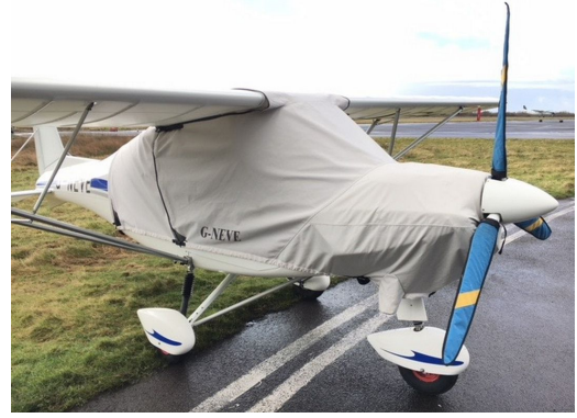
Ikarus C-42 Extended Canopy/Engine Cover