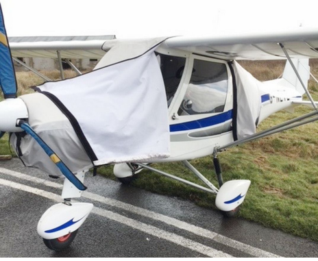
Ikarus C-42 Extended Canopy/Engine Cover