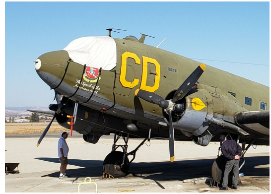
Douglas DC-3 Cockpit Cover