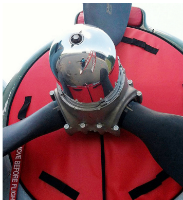
C-46 Radial Engine Intake Plug

Engine Inlet Plugs are custom fit for your Curtiss Wright C-46 Commando intakes, made with heavy-duty vinyl material, and stuffed with a single block of sculpted urethane foam. Each plug has a zipper that allows the foam to be removed and dried if necessary. Engine plugs have warning flags that are visible from the cockpit or 'remove before flight' streamers sewn onto the face of the plugs. Most plugs are imprinted with the aircraft registration number in black for an extra charge. Storage bag NOT included. Engine plugs may be inserted after flight when the engine is still warm. Engine Inlet Plugs are commonly referred to as Cowl Plugs, Intake Plugs, Cowl Blocks, Engine Blocks, and Engine Bung.