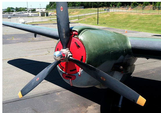
C-46 Radial Engine Intake Plug