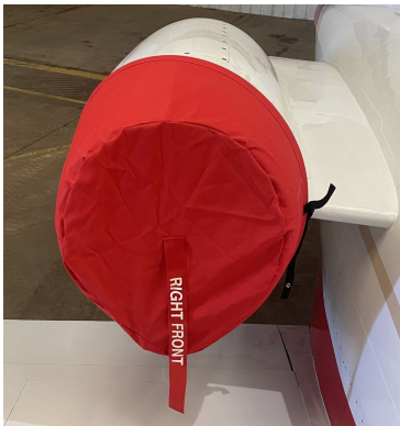
Cessna 501 Engine Covers NO TR's

The Cessna Citation I (500/501) Intake Covers are designed to install easily yet be completely storable. A spring steel hoop is sewn into the hem of each cover, allowing them to be installed without climbing onto the wing or using a stepladder. To store the covers the spring steel hoop folds like a band-saw blade into three nesting rings. Each cover folds into a compact circular bundle which is stored in the included duffle bag, yet they unfold quickly for use. The Tri-Fold Ring cover is made of medium weight nylon which is available in a variety of colors to match the paint trim. Each cover set comes complete with installation and folding instructions. The aircraft's registration number can be silkscreened onto the cover for an extra charge.