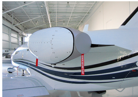
Citation Mustang Intake/Exhaust Cover, "Bikini" Type and leading edge Pylon inlet plugs