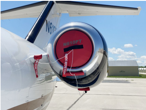
Cessna Citation Mustang 510 Engine Inlet Plugs, set of 8

The Engine Inlet Plugs are custom fit for your Cessna Mustang 510 intakes, made with heavy-duty vinyl material, and stuffed with a single block of sculpted urethane foam. Each plug has a zipper that allows the foam to be removed and dried if necessary. Engine plugs have 'remove before flight' streamers sewn onto the face of the plugs. Most plugs are imprinted with the aircraft registration number in black for an extra charge. Storage bag NOT included. Engine plugs may be inserted after flight when the engine is still warm. Engine Inlet Plugs are commonly referred to as Cowl Plugs, Intake Plugs, Cowl Blocks, Engine Blocks, and Engine Bungs.