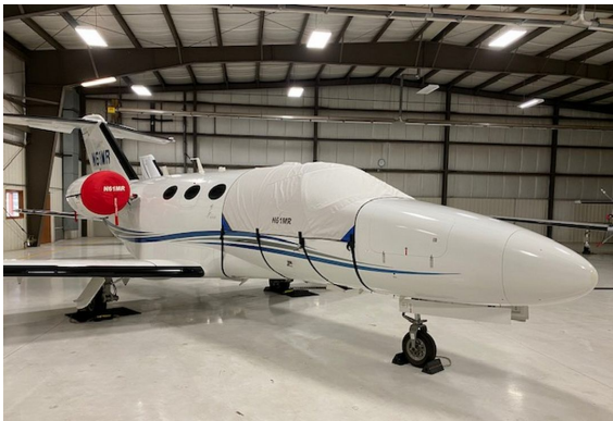
Cessna 510 Cockpit Cover extends to cover door

The Cessna Mustang 510 Intake/Exhaust Plugs are custom fit for the intake and exhaust openings, made with heavy-duty vinyl material, and stuffed with a single block of sculpted urethane foam. Each plug has a zipper that allows the foam to be removed and dried if necessary. Engine plugs have 'remove before flight' streamers sewn onto the face of the plugs. Most plugs are imprinted with the aircraft registration number in black. Engine plugs may be inserted after flight when the engine is still warm. Engine Inlet Plugs are commonly referred to as Cowl Plugs, Intake Plugs, Cowl Blocks, Engine Blocks, and Engine Bungs.