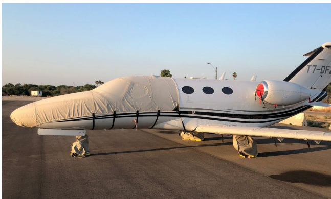
Cessna 510 Mustang Cockpit/Nose Cover, Engine Inlet Plugs

This cover type is made from Silver Acrylic Sunbrella canvas and is 100% lined with a soft and smooth microfiber. Bruce's Custom Covers developed this material combination especially for aircraft protection. The outer material is medium weight and treated for water resistance, UV resistance and anti-static buildup. The inner lining is a very soft and smooth microfiber to prevent scratching. The material is very reflective, and tests show that the cabin interior temperature can be reduced to near-ambient temperature on the hottest of days. It is water, ice and snow repellent, yet breathable to allow moisture to escape from between the cover and the aircraft surface.