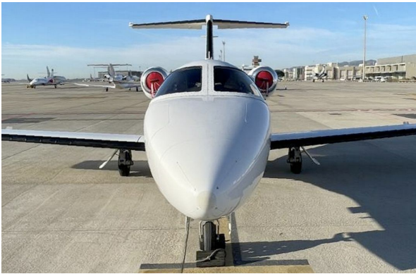
Cessna Mustang Engine Inlet Plugs

The Engine Inlet Plugs are custom fit for your Cessna Mustang 510 intakes, made with heavy-duty vinyl material, and stuffed with a single block of sculpted urethane foam. Each plug has a zipper that allows the foam to be removed and dried if necessary. Engine plugs have 'remove before flight' streamers sewn onto the face of the plugs. Most plugs are imprinted with the aircraft registration number in black for an extra charge. Storage bag NOT included. Engine plugs may be inserted after flight when the engine is still warm. Engine Inlet Plugs are commonly referred to as Cowl Plugs, Intake Plugs, Cowl Blocks, Engine Blocks, and Engine Bungs.