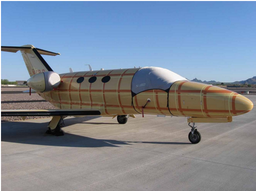
Citation Mustang Light Weight Windshield & Engine Covers

This cover type is made from Silver Acrylic Sunbrella canvas and is 100% lined with a soft and smooth microfiber. Bruce's Custom Covers developed this material combination especially for aircraft protection. The outer material is medium weight and treated for water resistance, UV resistance and anti-static buildup. The inner lining is a very soft and smooth microfiber to prevent scratching. The material is very reflective, and tests show that the cabin interior temperature can be reduced to near-ambient temperature on the hottest of days. It is water, ice and snow repellent, yet breathable to allow moisture to escape from between the cover and the aircraft surface.