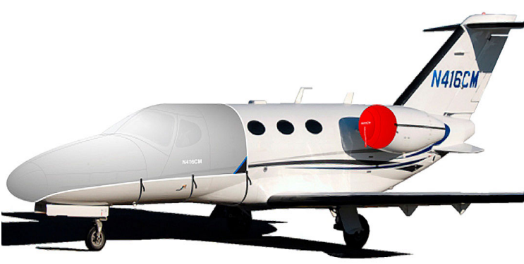
Citation Mustang Light Weight Travel Windshield Cover, "Bikini" type Engine Cover Set Citation Mustang Cockpit/Door/Nose Cover, Engine Inlet Cover