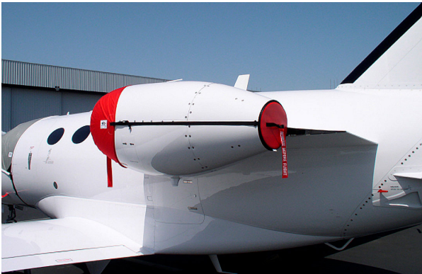
Citation Mustang Intake Cover/Exhaust Plug Set