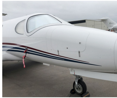
Cessna Mustang 510 Cockpit Heatshields, Pitot Cover/AOA