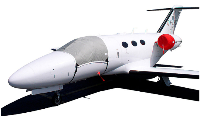
Citation Mustang Windshield Cover, Intake Cover/Exhaust Plug Set, Pitot Covers