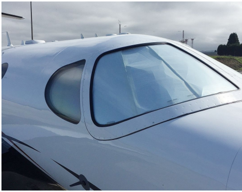
Cessna Mustang 510 Cockpit Heatshields