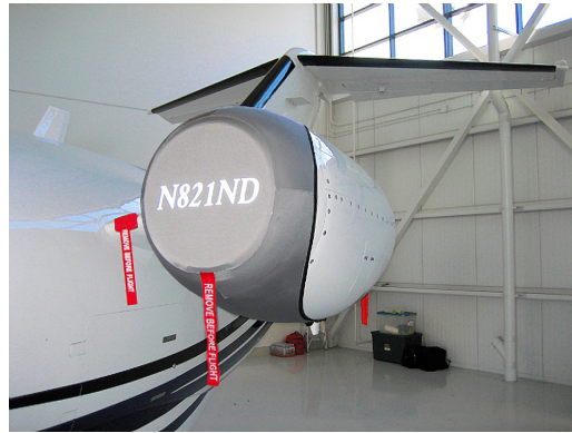
Citation Mustang Intake/Exhaust Cover, "Bikini" Type and leading edge Pylon inlet plugs