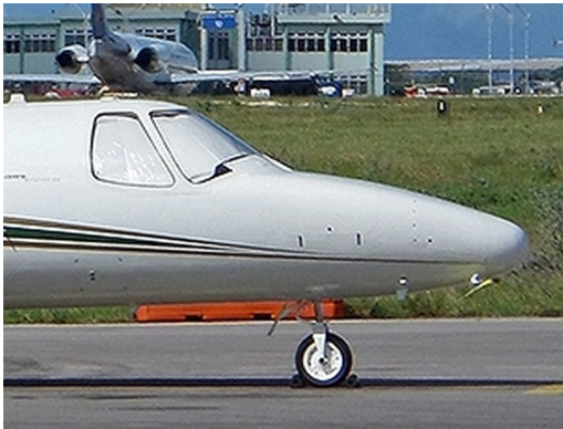
Cessna Citation S550 Cockpit HeatShields

Custom-made Heatshield Sunshades are available for almost any window in the jet. Side windows, Skylights, and Emergency Exits are all custom-made. The product is a unique composite of closed-cell foam with a silver mylar finish. The set is easily stored in the included storage sleeve. Some designs may require velcro and suction cups. Our Heatshields are offered white side out since aircraft manufacturers have issued advisories against reflective window inserts due to potential heat damage.