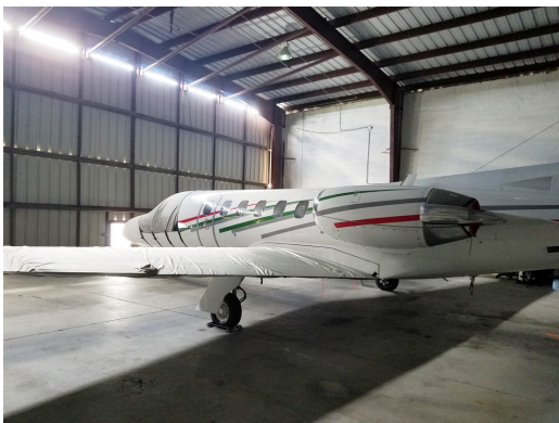
Cessna Citation II Cockpit Cover, Wing Covers