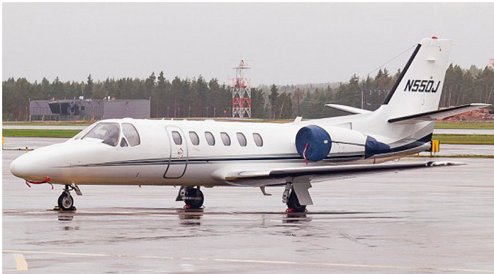
Cessna Citation Bravo Engine Covers and Pitot Covers sets

The Cessna Citation II (550, 551, UC-35A, with JT15D) Intake Covers are designed to install easily yet be completely storable. A spring steel hoop is sewn into the hem of each cover, allowing them to be installed without climbing onto the wing or using a stepladder. To store the covers the spring steel hoop folds like a band-saw blade into three nesting rings. Each cover folds into a compact circular bundle which is stored in the included duffle bag, yet they unfold quickly for use. The Tri-Fold Ring cover is made of medium weight nylon which is available in a variety of colors to match the paint trim. Each cover set comes complete with installation and folding instructions. The aircraft's registration number can be silkscreened onto the cover for an extra charge.