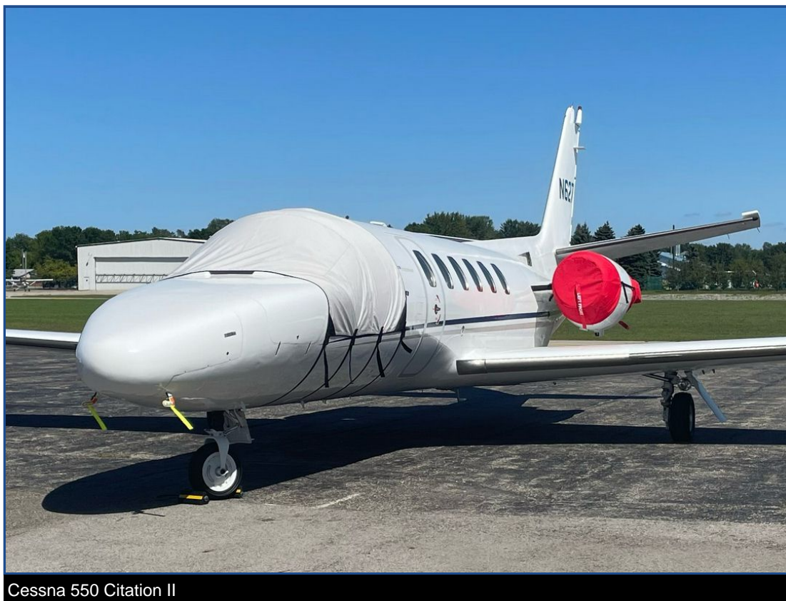
Cessna 550 Citation II