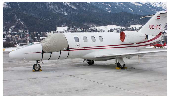
Cessna Citationjet CJ1 Cockpit Cover