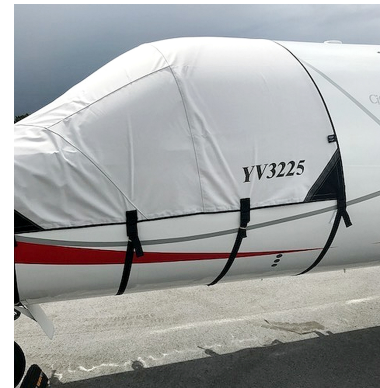
Cessna Citationjet V Ultra (560) Cockpit Cover