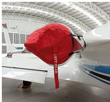
Cessna 551 Citation II SP Engine covers (with thrust reversers, smooth gen. inlet)

The Cessna Citation II (550, 551, UC-35A, with JT15D) Intake Covers are designed to install easily yet be completely storable. A spring steel hoop is sewn into the hem of each cover, allowing them to be installed without climbing onto the wing or using a stepladder. To store the covers the spring steel hoop folds like a band-saw blade into three nesting rings. Each cover folds into a compact circular bundle which is stored in the included duffle bag, yet they unfold quickly for use. The Tri-Fold Ring cover is made of medium weight nylon which is available in a variety of colors to match the paint trim. Each cover set comes complete with installation and folding instructions. The aircraft's registration number can be silkscreened onto the cover for an extra charge.