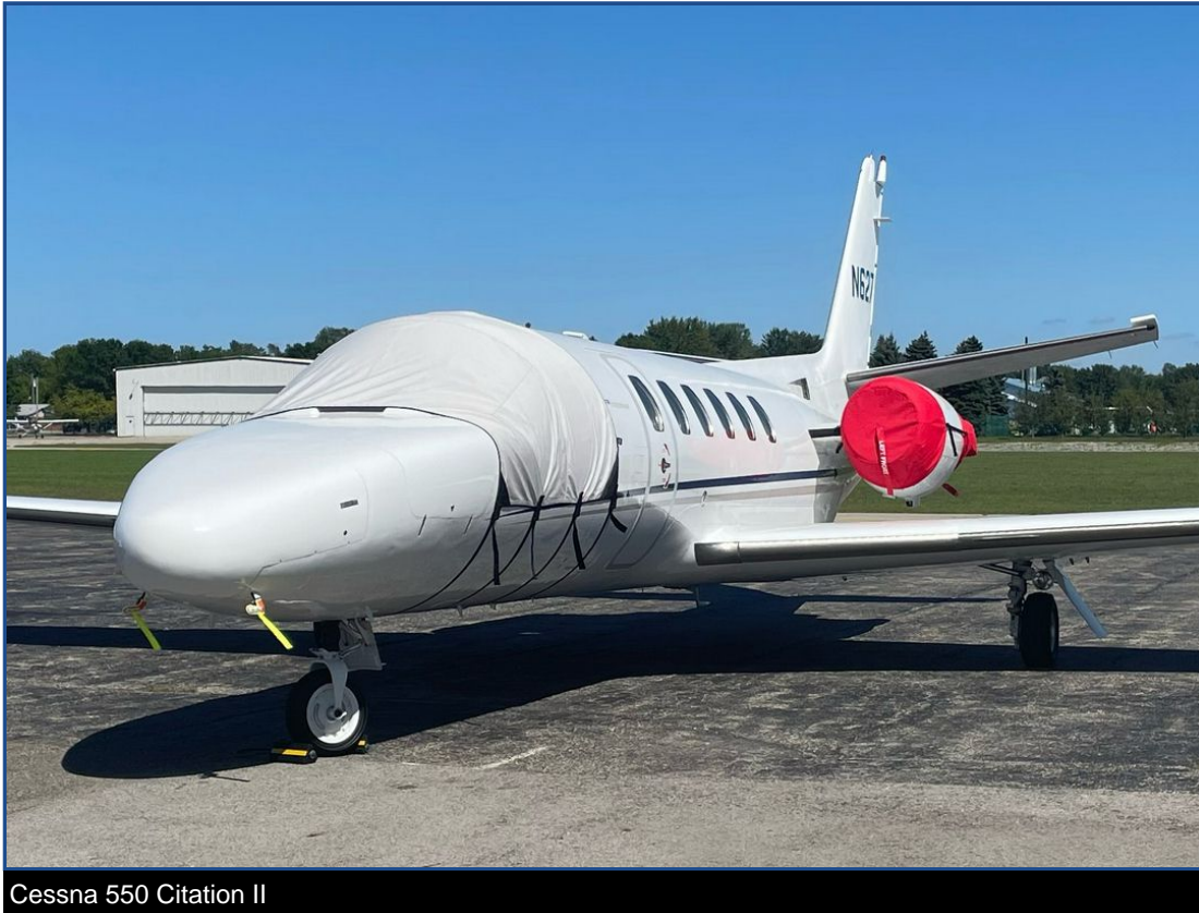
Cessna 550 Citation II