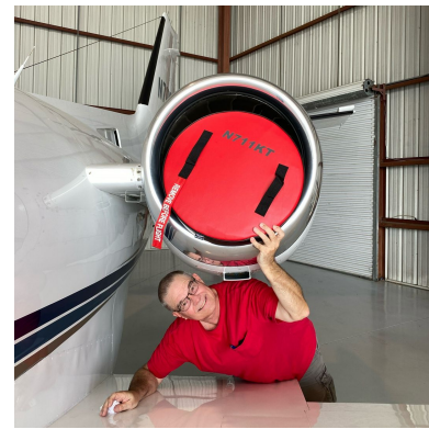
Citation II Engine Plugs