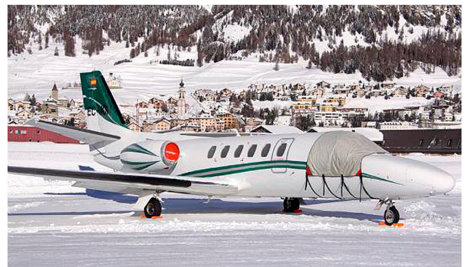
Cessna Citation 550 Windshield Cover