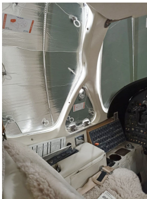
Cessna Citation I & II Cockpit HeatShields

Custom-made Heatshield Sunshades are available for almost any window in the jet. Side windows, Skylights, and Emergency Exits are all custom-made. The product is a unique composite of closed-cell foam with a silver mylar finish. The set is easily stored in the included storage sleeve. Some designs may require velcro and suction cups. Our Heatshields are offered white side out since aircraft manufacturers have issued advisories against reflective window inserts due to potential heat damage.