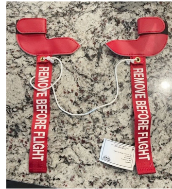
Cessna Citation Pitot Cover Set