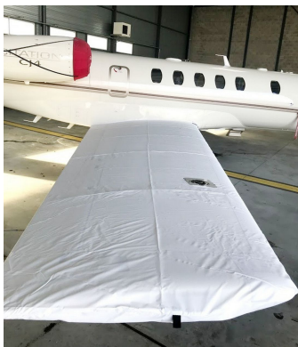
Cessna Citation CJ-4 Wing Covers, test fit cover

WINTER USE MATERIAL - Made with Solution-Dyed Polyester fabric, this option is intended for seasonal use to aid in deicing, rain mitigation, or for occasional travel. The material is lighter and more compact, but more susceptible to UV damage and may have a shorter useful life if used continuously outside than the all-year use material.