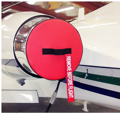
Cessna Citation S2 Exhaust Plugs

The Engine Inlet Plugs are custom fit for your Cessna Citation II (550, 551, UC-35A, with JT15D) intakes, made with heavy-duty vinyl material, and stuffed with a single block of sculpted urethane foam. Each plug has a zipper that allows the foam to be removed and dried if necessary. Engine plugs have 'remove before flight' streamers sewn onto the face of the plugs. Most plugs are imprinted with the aircraft registration number in black for an extra charge. Storage bag NOT included. Engine plugs may be inserted after flight when the engine is still warm. Engine Inlet Plugs are commonly referred to as Cowl Plugs, Intake Plugs, Cowl Blocks, Engine Blocks, and Engine Bungs.