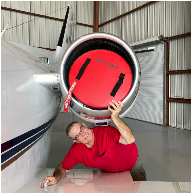
Citation II Engine Plugs

The Engine Inlet Plugs are custom fit for your Cessna Citation II (550, 551, UC-35A, with JT15D) intakes, made with heavy-duty vinyl material, and stuffed with a single block of sculpted urethane foam. Each plug has a zipper that allows the foam to be removed and dried if necessary. Engine plugs have 'remove before flight' streamers sewn onto the face of the plugs. Most plugs are imprinted with the aircraft registration number in black for an extra charge. Storage bag NOT included. Engine plugs may be inserted after flight when the engine is still warm. Engine Inlet Plugs are commonly referred to as Cowl Plugs, Intake Plugs, Cowl Blocks, Engine Blocks, and Engine Bungs.