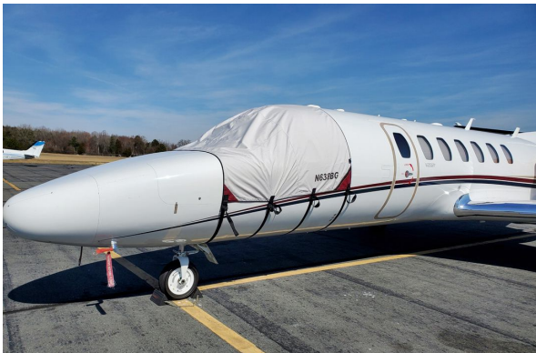
Cessna Citation 560 Cockpit Cover

This cover type is made from Silver Acrylic Sunbrella canvas and is 100% lined with a soft and smooth microfiber. Bruce's Custom Covers developed this material combination especially for aircraft protection. The outer material is medium weight and treated for water resistance, UV resistance and anti-static buildup. The inner lining is a very soft and smooth microfiber to prevent scratching. The material is very reflective, and tests show that the cabin interior temperature can be reduced to near-ambient temperature on the hottest of days. It is water, ice and snow repellent, yet breathable to allow moisture to escape from between the cover and the aircraft surface.