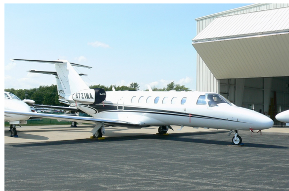
Cessna Citation CJ3 Bikini Style Engine Covers