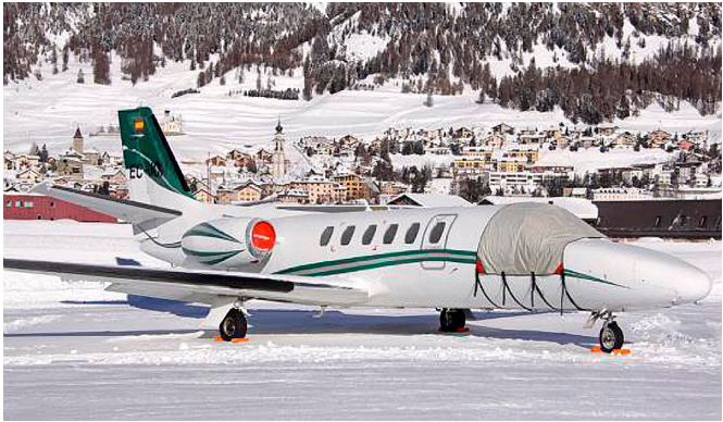
Cessna Citation 550 Windshield Cover