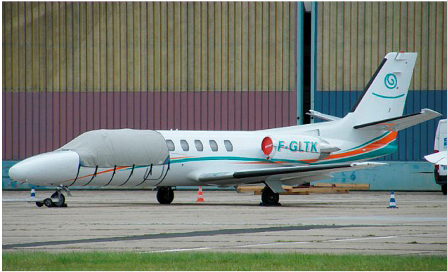
Citation Windshield Cover, to back of door

This cover type is made from Silver Acrylic Sunbrella canvas and is 100% lined with a soft and smooth microfiber. Bruce's Custom Covers developed this material combination especially for aircraft protection. The outer material is medium weight and treated for water resistance, UV resistance and anti-static buildup. The inner lining is a very soft and smooth microfiber to prevent scratching. The material is very reflective, and tests show that the cabin interior temperature can be reduced to near-ambient temperature on the hottest of days. It is water, ice and snow repellent, yet breathable to allow moisture to escape from between the cover and the aircraft surface.