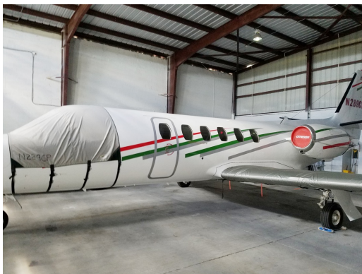
Cessna Citation II Cockpit Cover, Wing Covers

WINTER USE MATERIAL - Made with Solution-Dyed Polyester fabric, this option is intended for seasonal use to aid in deicing, rain mitigation, or for occasional travel. The material is lighter and more compact, but more susceptible to UV damage and may have a shorter useful life if used continuously outside than the all-year use material.