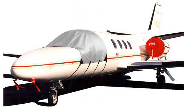
Citation Windshield Cover, Engine Cover set and Pitot Covers