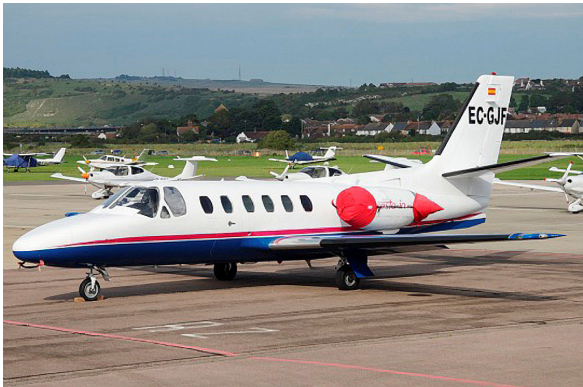
Cessna Citation II Engine Covers, Pitot Covers