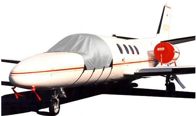
Cessna Citationjet V Ultra (560) Intake Plugs, With Pylon Plugs Citation Windshield Cover, Engine Cover set and Pitot Covers