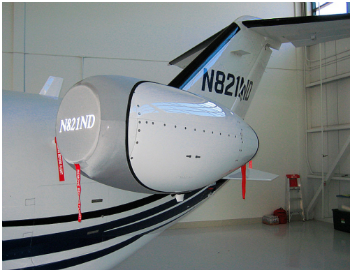
Cessna 510 Mustang Bikini Type Engine Cover

The Cessna Citationjet V Ultra & Encore Models Intake/Exhaust Plugs are custom fit for the intake and exhaust openings, made with heavy-duty vinyl material, and stuffed with a single block of sculpted urethane foam. Each plug has a zipper that allows the foam to be removed and dried if necessary. Engine plugs have 'remove before flight' streamers sewn onto the face of the plugs. Most plugs are imprinted with the aircraft registration number in black. Engine plugs may be inserted after flight when the engine is still warm. Engine Inlet Plugs are commonly referred to as Cowl Plugs, Intake Plugs, Cowl Blocks, Engine Blocks, and Engine Bungs.