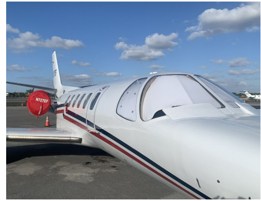
Cessna Citation S550