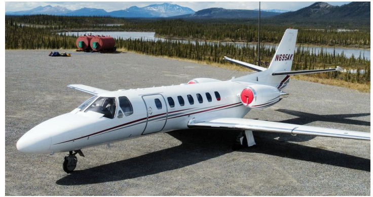
Cessna Citationjet V Ultra (560) Intake Plugs, With Pylon Plugs