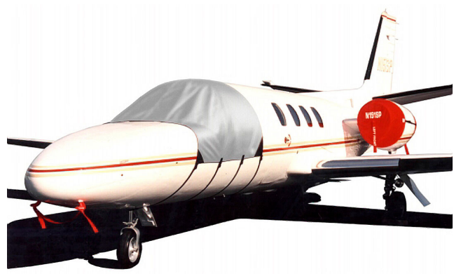
Cessna Citation Windshield Cover, Engine Cover set and Pitot Covers