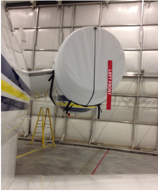
Cessna Citation 560XL Upper Nacelle/Brightwork Covers

The Cessna Citation II Bravo Intake/Exhaust Plugs are custom fit for the intake and exhaust openings, made with heavy-duty vinyl material, and stuffed with a single block of sculpted urethane foam. Each plug has a zipper that allows the foam to be removed and dried if necessary. Engine plugs have 'remove before flight' streamers sewn onto the face of the plugs. Most plugs are imprinted with the aircraft registration number in black. Engine plugs may be inserted after flight when the engine is still warm. Engine Inlet Plugs are commonly referred to as Cowl Plugs, Intake Plugs, Cowl Blocks, Engine Blocks, and Engine Bungs.