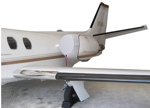
Cessna Citation "Bikini" Type Engine Covers: Extremely Light & Portable

The Cessna Citation II Bravo Intake/Exhaust Plugs are custom fit for the intake and exhaust openings, made with heavy-duty vinyl material, and stuffed with a single block of sculpted urethane foam. Each plug has a zipper that allows the foam to be removed and dried if necessary. Engine plugs have 'remove before flight' streamers sewn onto the face of the plugs. Most plugs are imprinted with the aircraft registration number in black. Engine plugs may be inserted after flight when the engine is still warm. Engine Inlet Plugs are commonly referred to as Cowl Plugs, Intake Plugs, Cowl Blocks, Engine Blocks, and Engine Bungs.