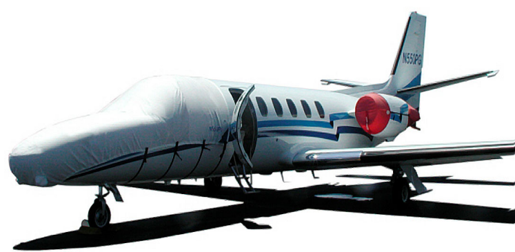
Cessna Citation Nose/Cockpit Cover, Engine Covers

This cover type is made from Silver Acrylic Sunbrella canvas and is 100% lined with a soft and smooth microfiber. Bruce's Custom Covers developed this material combination especially for aircraft protection. The outer material is medium weight and treated for water resistance, UV resistance and anti-static buildup. The inner lining is a very soft and smooth microfiber to prevent scratching. The material is very reflective, and tests show that the cabin interior temperature can be reduced to near-ambient temperature on the hottest of days. It is water, ice and snow repellent, yet breathable to allow moisture to escape from between the cover and the aircraft surface.