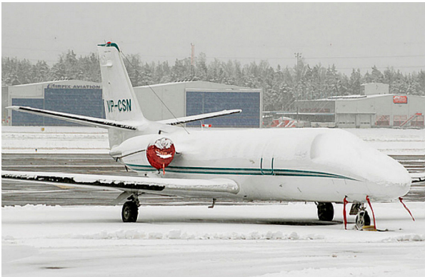
Cessna 560 Engine Inlet/Exhaust Covers, Pitot Cover Set