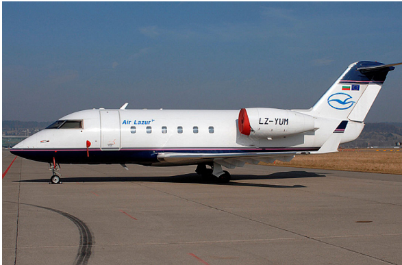
Challenger 600 Intake Covers