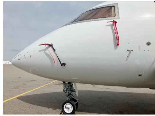
Challenger 650 Pitot & Ice Detector Covers