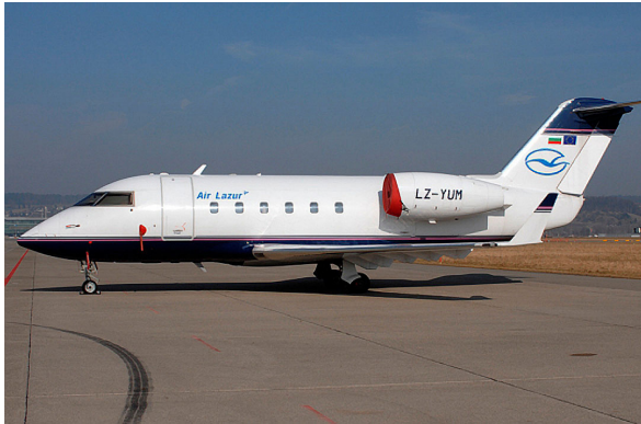
Challenger 600 Intake Covers

The Canadair Challenger 600 Intake Covers are designed to install easily yet be completely storable. A spring steel hoop is sewn into the hem of each cover, allowing them to be installed without climbing onto the wing or using a stepladder. To store the covers the spring steel hoop folds like a band-saw blade into three nesting rings. Each cover folds into a compact circular bundle which is stored in the included duffle bag, yet they unfold quickly for use. The Tri-Fold Ring cover is made of medium weight nylon which is available in a variety of colors to match the paint trim. Each cover set comes complete with installation and folding instructions. The aircraft's registration number can be silkscreened onto the cover for an extra charge.