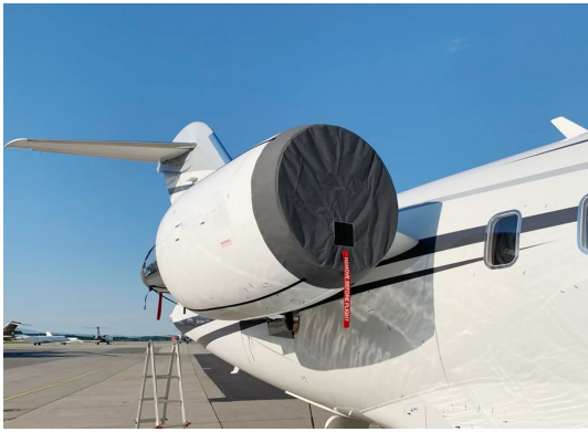
Canadair Challenger 604, 605, 650, 850 Intake/Exhaust Covers (OEM Design)