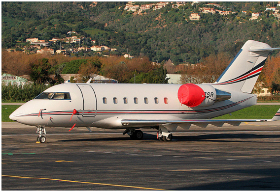
Challenger 601 Intake Covers, standard design