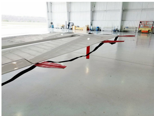
Hawker Beechcraft 800, 800XP, 850XP Static Wick Protectors

with the aircraft registration number in black for an extra charge. Storage bag NOT included. Engine plugs may be inserted after flight when the engine is still warm. Engine Inlet Plugs are commonly referred to as Cowl Plugs, Intake Plugs, Cowl Blocks, Engine Blocks, and Engine Bungs.