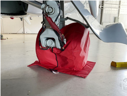
Canadair Challenger 605 Main Gear Tire Covers

ALL-YEAR USE MATERIAL - Made with Silver Acrylic Sunbrella canvas, the all-year use material is the best option for sun protection and cover longevity. This heavier more durable material is intended for all weather conditions, such as rain and snow or lots of sun.