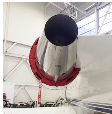
Canadair Challenger 604 Bypass Plugs