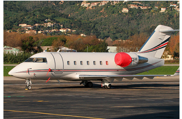
Challenger 601 Intake Covers, standard design