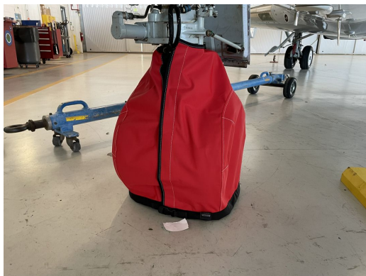
Canadair Challenger 605 Nose Gear Tire Cover

ALL-YEAR USE MATERIAL - Made with Silver Acrylic Sunbrella canvas, the all-year use material is the best option for sun protection and cover longevity. This heavier more durable material is intended for all weather conditions, such as rain and snow or lots of sun.