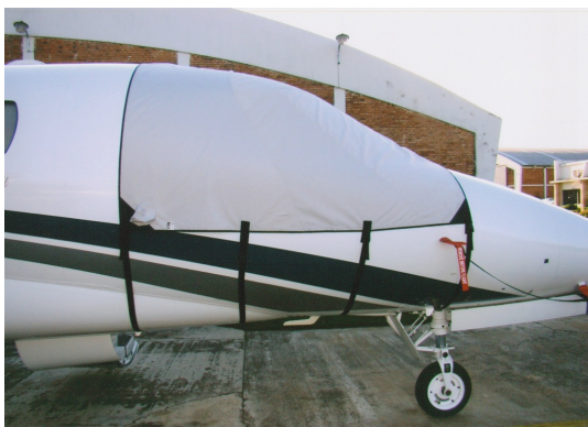
Citation XL Cockpit Cover

This cover type is made from Silver Acrylic Sunbrella canvas and is 100% lined with a soft and smooth microfiber. Bruce's Custom Covers developed this material combination especially for aircraft protection. The outer material is medium weight and treated for water resistance, UV resistance and anti-static buildup. The inner lining is a very soft and smooth microfiber to prevent scratching. The material is very reflective, and tests show that the cabin interior temperature can be reduced to near-ambient temperature on the hottest of days. It is water, ice and snow repellent, yet breathable to allow moisture to escape from between the cover and the aircraft surface.