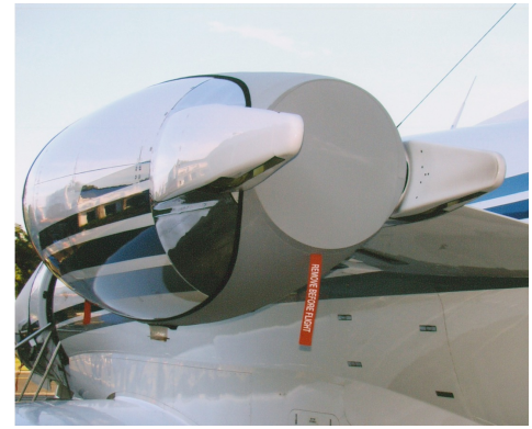
Citation XL Bikini Style Engine Covers