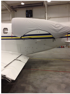
Cessna Citation 560XL Upper Nacelle/Brightwork Covers