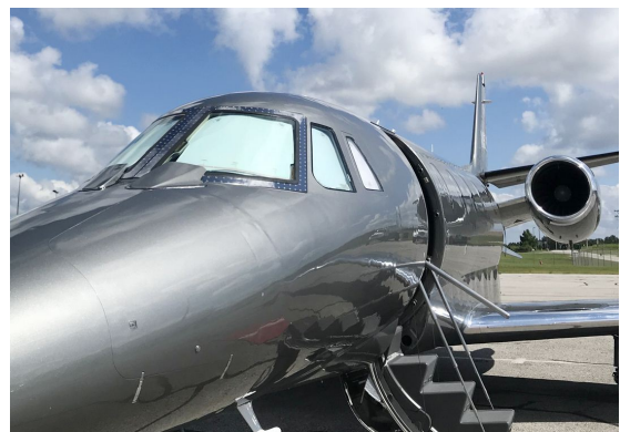
Cessna Citation 560XL Cockpit HeatShields