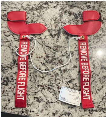
Cessna Citation Pitot Cover Set