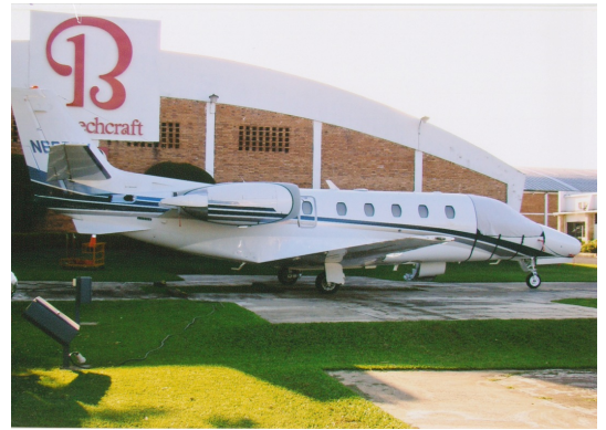
Cessna Citation "Bikini" Type Engine Covers: Extremely Light & Portable Citation XL Cockpit Cover & Bikini Type Engine Cover