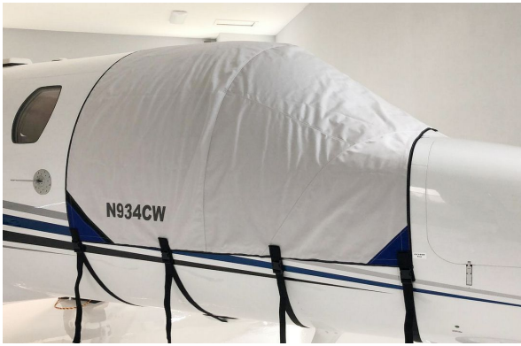
Cessna Citation M2 Cockpit Cover