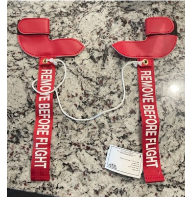
Cessna Citation Pitot Cover Set