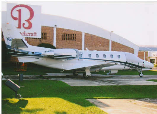
Citation XL Cockpit Cover & Bikini Type Engine Cover

The Cessna Citation VII (650) Intake/Exhaust Plugs are custom fit for the intake and exhaust openings, made with heavy-duty vinyl material, and stuffed with a single block of sculpted urethane foam. Each plug has a zipper that allows the foam to be removed and dried if necessary. Engine plugs have 'remove before flight' streamers sewn onto the face of the plugs. Most plugs are imprinted with the aircraft registration number in black. Engine plugs may be inserted after flight when the engine is still warm. Engine Inlet Plugs are commonly referred to as Cowl Plugs, Intake Plugs, Cowl Blocks, Engine Blocks, and Engine Bungs.