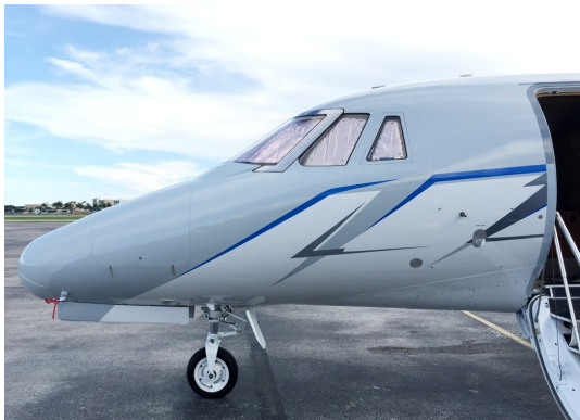
Cessna Citation 650 Cockpit HeataShields

Cockpit Heatshields are interior sunshades for the aircraft's cockpit. The product is a unique composite of closed-cell foam with a silver mylar finish. The semi-rigid design is stiff enough to stand inside the window framing. The set folds up flat and is easily stored in the included storage sleeve. Some designs may require velcro and suction cups. Our Heatshields for jets are offered white side out because some aircraft manufacturers have issued advisories against reflective window inserts due to potential heat damage. A Heatshield is an excellent short-term remedy for cockpit overheating, but an external fabric cover is more effective for long-term protection.