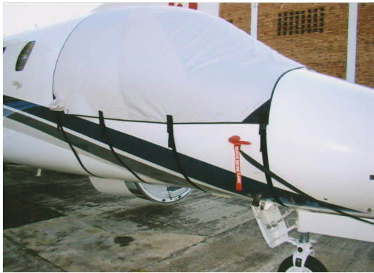
Citation XL Cockpit Cover

This cover type is made from Silver Acrylic Sunbrella canvas and is 100% lined with a soft and smooth microfiber. Bruce's Custom Covers developed this material combination especially for aircraft protection. The outer material is medium weight and treated for water resistance, UV resistance and anti-static buildup. The inner lining is a very soft and smooth microfiber to prevent scratching. The material is very reflective, and tests show that the cabin interior temperature can be reduced to near-ambient temperature on the hottest of days. It is water, ice and snow repellent, yet breathable to allow moisture to escape from between the cover and the aircraft surface.