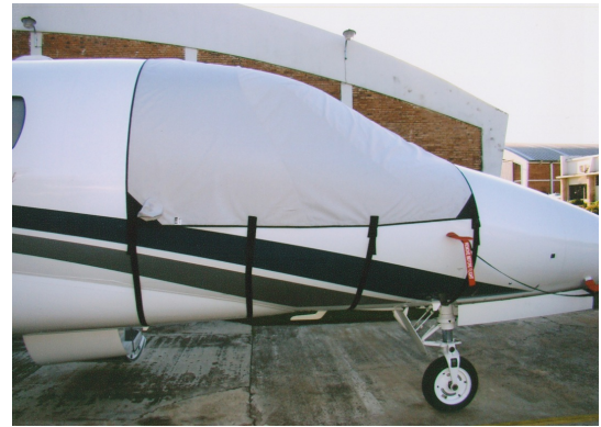
Citation XL Cockpit Cover