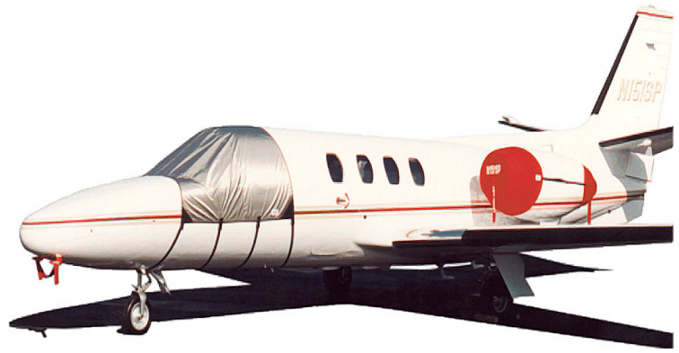
Cessna Citation I Windshield, Pitot and Engine Covers