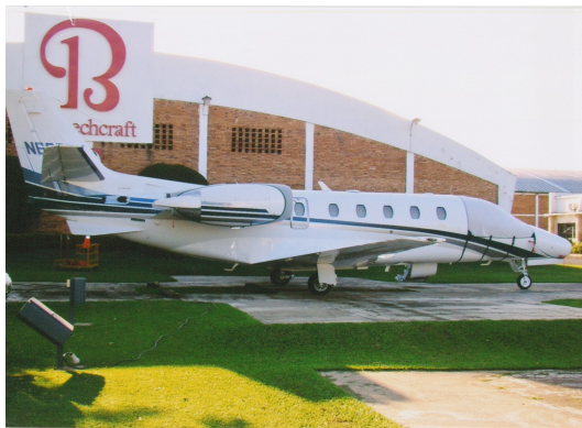
Citation XL Cockpit Cover & Bikini Type Engine Cover

The Cessna Citation VII (650) Intake/Exhaust Plugs are custom fit for the intake and exhaust openings, made with heavy-duty vinyl material, and stuffed with a single block of sculpted urethane foam. Each plug has a zipper that allows the foam to be removed and dried if necessary. Engine plugs have 'remove before flight' streamers sewn onto the face of the plugs. Most plugs are imprinted with the aircraft registration number in black. Engine plugs may be inserted after flight when the engine is still warm. Engine Inlet Plugs are commonly referred to as Cowl Plugs, Intake Plugs, Cowl Blocks, Engine Blocks, and Engine Bungs.