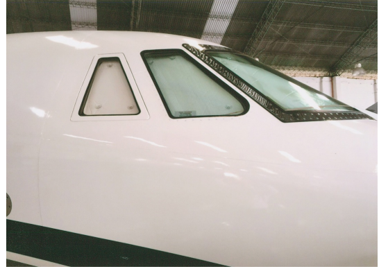
Citation XL Cockpit HeatShields