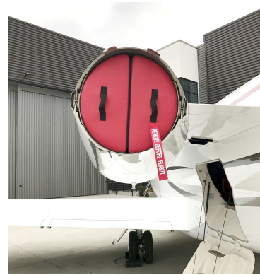
Cessna Citation 680 Exhaust Plugs, folding type