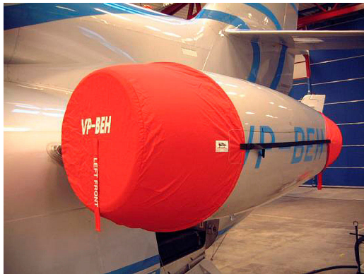
Falcon 900 Sovereign Engine Covers

The Cessna Citation Latitude (680A) Intake/Exhaust Plugs are custom fit for the intake and exhaust openings, made with heavy-duty vinyl material, and stuffed with a single block of sculpted urethane foam. Each plug has a zipper that allows the foam to be removed and dried if necessary. Engine plugs have 'remove before flight' streamers sewn onto the face of the plugs. Most plugs are imprinted with the aircraft registration number in black. Engine plugs may be inserted after flight when the engine is still warm. Engine Inlet Plugs are commonly referred to as Cowl Plugs, Intake Plugs, Cowl Blocks, Engine Blocks, and Engine Bungs.