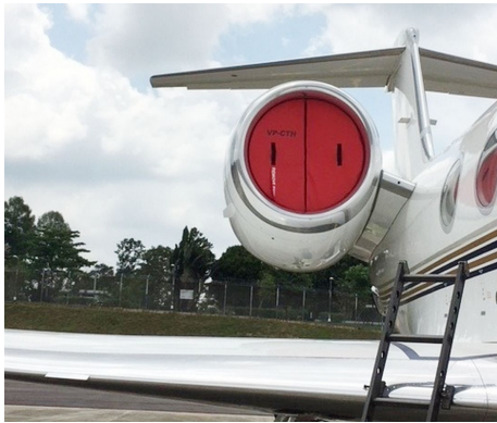
Grumman Gulfstream G450 Intake Plugs

The Engine Inlet Plugs are custom fit for your Cessna Citation Latitude (680A) intakes, made with heavy-duty vinyl material, and stuffed with a single block of sculpted urethane foam. Each plug has a zipper that allows the foam to be removed and dried if necessary. Engine plugs have 'remove before flight' streamers sewn onto the face of the plugs. Most plugs are imprinted with the aircraft registration number in black for an extra charge. Storage bag NOT included. Engine plugs may be inserted after flight when the engine is still warm. Engine Inlet Plugs are commonly referred to as Cowl Plugs, Intake Plugs, Cowl Blocks, Engine Blocks, and Engine Bungs.