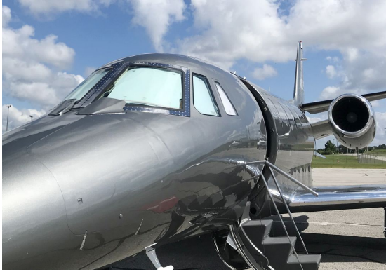
Cessna Citation 560XL Cockpit HeatShields

Cockpit Heatshields are interior sunshades for the aircraft's cockpit. The product is a unique composite of closed-cell foam with a silver mylar finish. The semi-rigid design is stiff enough to stand inside the window framing. The set folds up flat and is easily stored in the included storage sleeve. Some designs may require velcro and suction cups. Our Heatshields for jets are offered white side out because some aircraft manufacturers have issued advisories against reflective window inserts due to potential heat damage. A Heatshield is an excellent short-term remedy for cockpit overheating, but an external fabric cover is more effective for long-term protection.