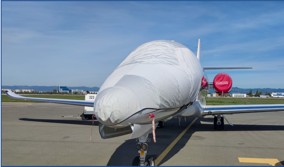
Cessna Citation Latitude (680A) Cockpit/Nose Cover, Doesn't Cover Pitot Tubes