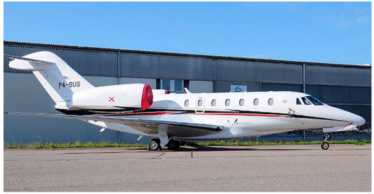
Citation X Intake & Pitot Tube Covers