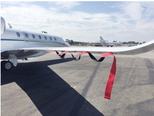
Citation X Static Wick Protectors