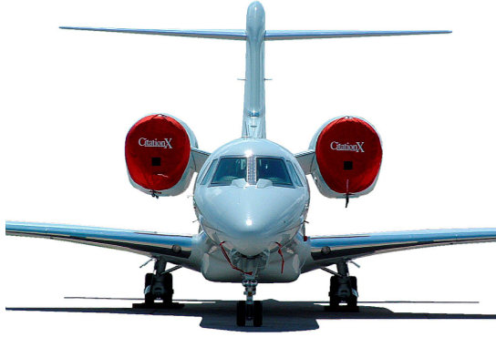
Citation X Intake Covers

which is stored in the included duffel bag, yet they unfold quickly for use. The Tri-Fold Ring cover is made of medium weight nylon which is available in a variety of colors to match the paint trim. Each cover set comes complete with installation and folding instructions. The aircraft's registration number can be silkscreened onto the cover for an extra charge.