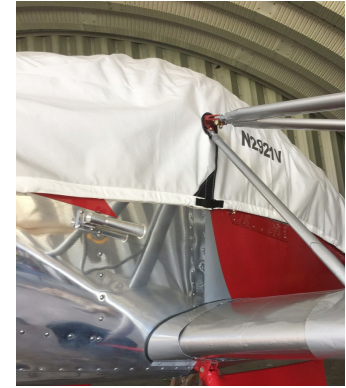
Callair A-2 Canopy Cover