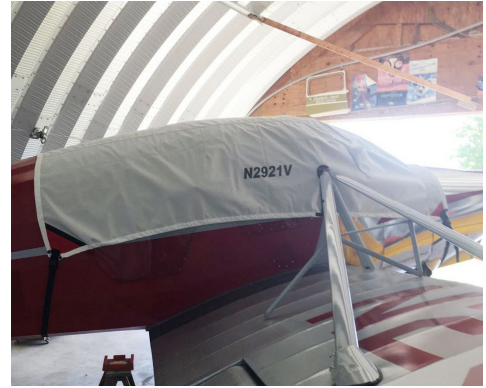
Callair A-2 Canopy Cover