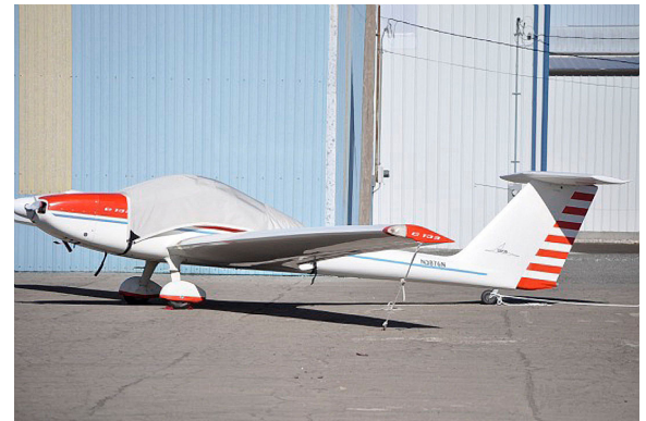
Grob 109 Canopy Cover