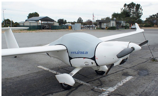
Lambda Travel Canopy Cover