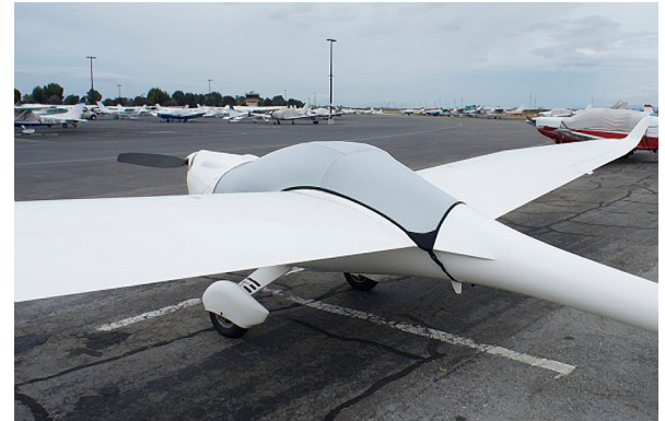
Grob 109 Canopy/Engine w/ extension to tail, Wing, Stabilizer & Prop/Spinner Covers Lambada Canopy/Engine Cover and Wing Covers