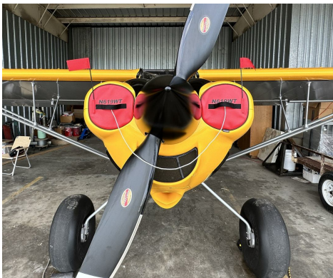
Cub Crafters CC-19 X-Cub Engine Plugs

Engine Inlet Plugs are custom fit for your CubCrafters CC-11, Sport Cub S2, & Carbon Cub intakes, made with heavy-duty vinyl material, and stuffed with a single block of sculpted urethane foam. Each plug has a zipper that allows the foam to be removed and dried if necessary. Engine plugs have warning flags that are visible from the cockpit or 'remove before flight' streamers sewn onto the face of the plugs. Most plugs are imprinted with the aircraft registration number in black for an extra charge. Storage bag NOT included. Engine plugs may be inserted after flight when the engine is still warm. Engine Inlet Plugs are commonly referred to as Cowl Plugs, Intake Plugs, Cowl Blocks, Engine Blocks, and Engine Bungs.