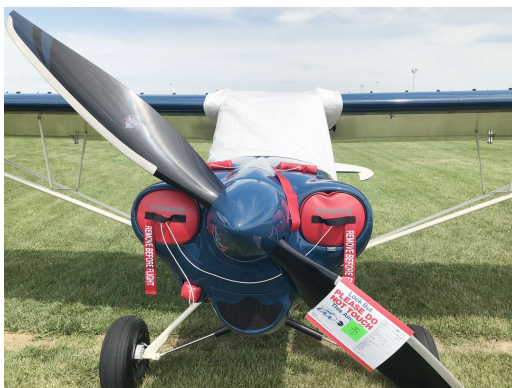
Cub Crafters EX2 Canopy Cover, Engine Plugs

Engine Inlet Plugs are custom fit for your CubCrafters CC-11, Sport Cub S2, & Carbon Cub intakes, made with heavy-duty vinyl material, and stuffed with a single block of sculpted urethane foam. Each plug has a zipper that allows the foam to be removed and dried if necessary. Engine plugs have warning flags that are visible from the cockpit or 'remove before flight' streamers sewn onto the face of the plugs. Most plugs are imprinted with the aircraft registration number in black for an extra charge. Storage bag NOT included. Engine plugs may be inserted after flight when the engine is still warm. Engine Inlet Plugs are commonly referred to as Cowl Plugs, Intake Plugs, Cowl Blocks, Engine Blocks, and Engine Bungs.