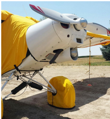
Piper PA-18 Super Cub Extended Canopy Cover, Wing & Tire Covers

ALL-YEAR USE MATERIAL - Made with Silver Acrylic Sunbrella canvas, the all-year use material is the best option for sun protection and cover longevity. This heavier more durable material is intended for all weather conditions, such as rain and snow or lots of sun.