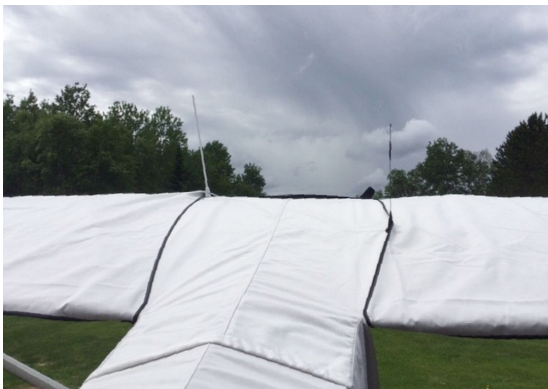
Piper PA-18-150 Super Cub Complete Cover Set

This cover type is made from Silver Acrylic Sunbrella canvas and is 100% lined with a soft and smooth microfiber. Bruce's Custom Covers developed this material combination especially for aircraft protection. The outer material is medium weight and treated for water resistance, UV resistance and anti-static buildup. The inner lining is a very soft and smooth microfiber to prevent scratching. The material is very reflective, and tests show that the cabin interior temperature can be reduced to near-ambient temperature on the hottest of days. It is water, ice and snow repellent, yet breathable to allow moisture to escape from between the cover and the aircraft surface.