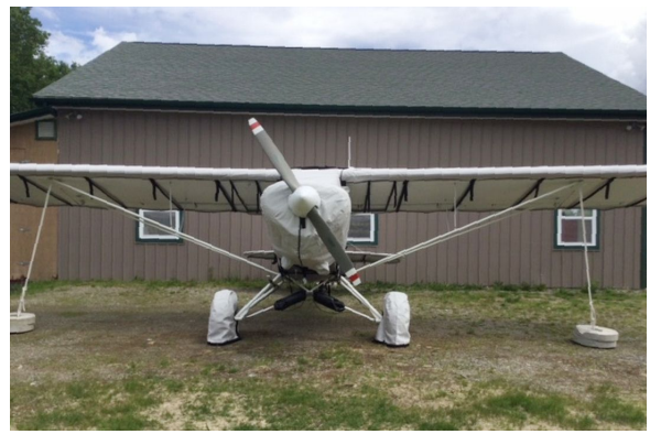
Piper PA-18-150 Super Cub Complete Cover Set