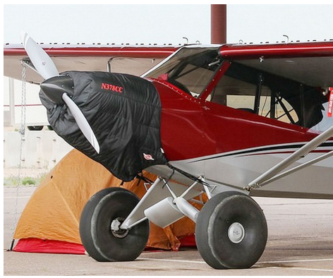
Cub Crafters Carbon Cub Insulated Engine Cover