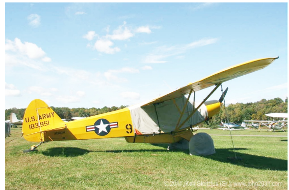
Piper L-21b Extended Canopy Cover, Tire Covers