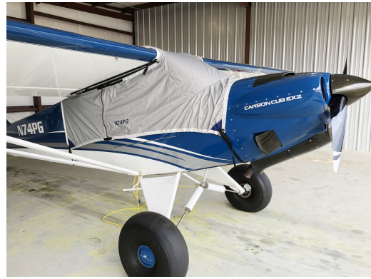
Cub Crafters Carbon Cub Travel Weight Canopy Cover