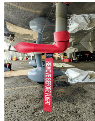
Van's RV-14 Pitot Cover