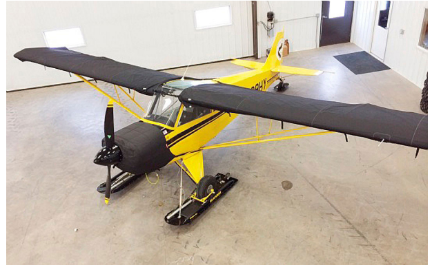
Aviat Husky Insulated Engine Cover, Wing Covers