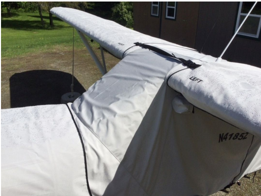
Piper PA-18-150 Super Cub Complete Cover Set