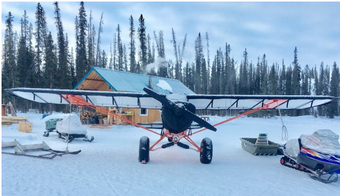
Piper PA-18 Super Cub Canopy Cover (Over-The-Top Style)

WINTER USE MATERIAL - Made with Solution-Dyed Polyester fabric, this option is intended for seasonal use to aid in deicing, rain mitigation, or for occasional travel. The material is lighter and more compact, but more susceptible to UV damage and may have a shorter useful life if used continuously outside than the all-year use material.