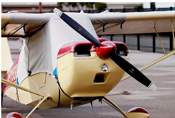
Bellanca Citabria Over-the-Top Canopy Cover, extended to cover gas caps

This cover type is made from Silver Acrylic Sunbrella canvas and is 100% lined with a soft and smooth microfiber. Bruce's Custom Covers developed this material combination especially for aircraft protection. The outer material is medium weight and treated for water resistance, UV resistance and anti-static buildup. The inner lining is a very soft and smooth microfiber to prevent scratching. The material is very reflective, and tests show that the cabin interior temperature can be reduced to near-ambient temperature on the hottest of days. It is water, ice and snow repellent, yet breathable to allow moisture to escape from between the cover and the aircraft surface.