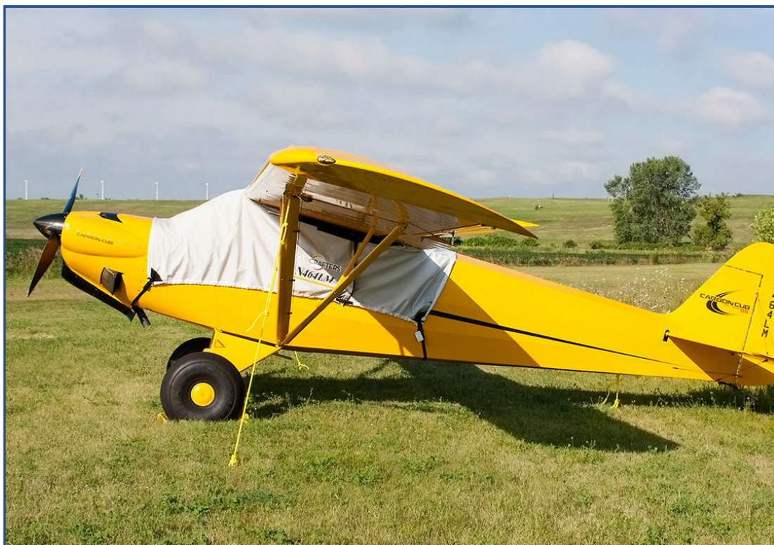
Cub Crafters Canopy Cover