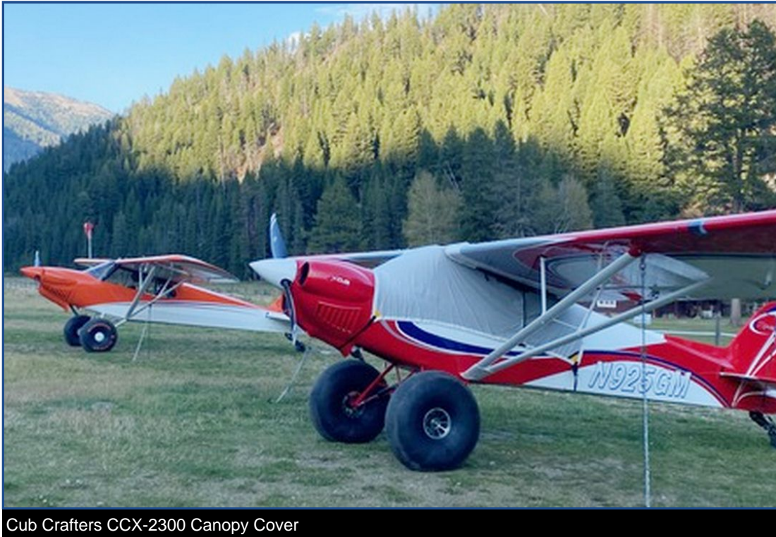
Cub Crafters CCX-2300 Canopy Cover