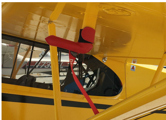
Cub Crafters CC-11 Carbon Cub Pitot Cover

Engine Inlet Plugs are custom fit for your CubCrafters CC-18, 19, 20, Top Cub, CCK-1865, CC-19 X-Cub, CCX-2000, EX-3, FX-3 intakes, made with heavy-duty vinyl material, and stuffed with a single block of sculpted urethane foam. Each plug has a zipper that allows the foam to be removed and dried if necessary. Engine plugs have warning flags that are visible from the cockpit or 'remove before flight' streamers sewn onto the face of the plugs. Most plugs are imprinted with the aircraft registration number in black for an extra charge. Storage bag NOT included. Engine plugs may be inserted after flight when the engine is still warm. Engine Inlet Plugs are commonly referred to as Cowl Plugs, Intake Plugs, Cowl Blocks, Engine Blocks, and Engine Bungs.