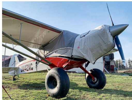
Cub Crafters CC19 X-Cub Engine Cover, Travel Weight Canopy Cover