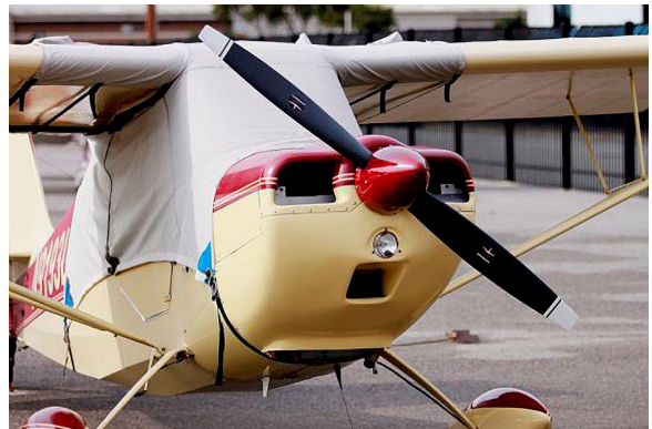
Bellanca Citabria Over-the-Top Canopy Cover, extended to cover gas caps