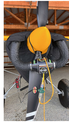
CubCrafters CCX-2000 Insulated Engine Cover