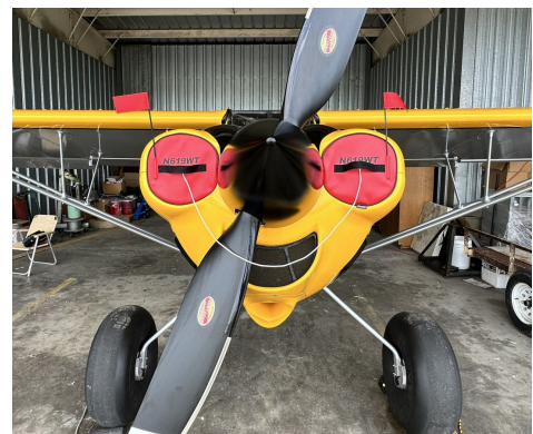
Cub Crafters CC-19 X-Cub Engine Plugs