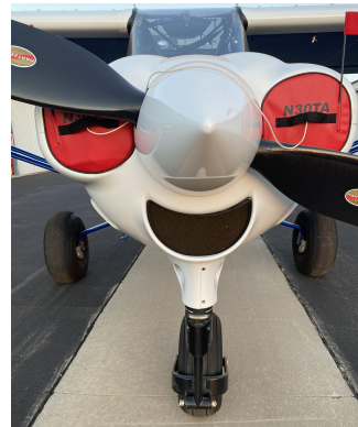
CubCrafters CC-18, 19, 20, Top Cub, CCK-1865, CC-19 X-Cub, CCX-2000, EX-3, FX-3 Engine Inlet Plugs