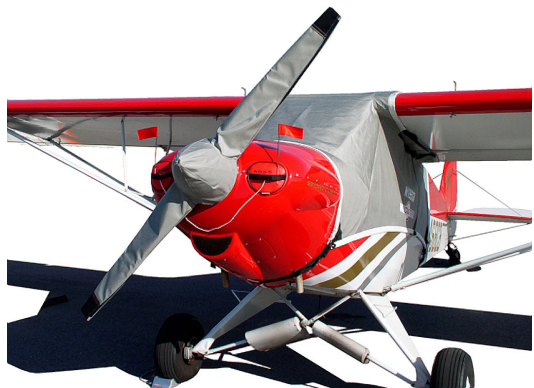
Cub Crafters Sport Cub Prop Cover & Engine Plugs

Engine Inlet Plugs are custom fit for your CubCrafters CC-18, 19, 20, Top Cub, CCK-1865, CC-19 X-Cub, CCX-2000, EX-3, FX-3 intakes, made with heavy-duty vinyl material, and stuffed with a single block of sculpted urethane foam. Each plug has a zipper that allows the foam to be removed and dried if necessary. Engine plugs have warning flags that are visible from the cockpit or 'remove before flight' streamers sewn onto the face of the plugs. Most plugs are imprinted with the aircraft registration number in black for an extra charge. Storage bag NOT included. Engine plugs may be inserted after flight when the engine is still warm. Engine Inlet Plugs are commonly referred to as Cowl Plugs, Intake Plugs, Cowl Blocks, Engine Blocks, and Engine Bunges.