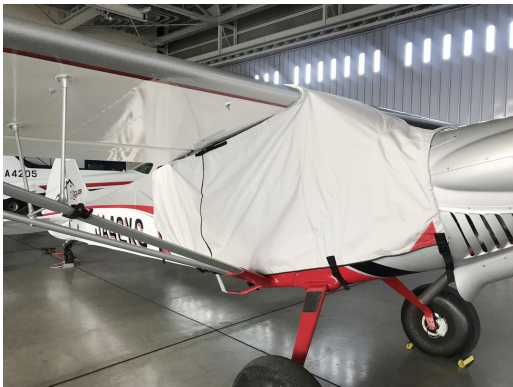
Cub Crafters X Cub CC19-180 Extended Canopy Cover (Over-The-Top-Style)

This cover type is made from Silver Acrylic Sunbrella canvas and is 100% lined with a soft and smooth microfiber. Bruce's Custom Covers developed this material combination especially for aircraft protection. The outer material is medium weight and treated for water resistance, UV resistance and anti-static buildup. The inner lining is a very soft and smooth microfiber to prevent scratching. The material is very reflective, and tests show that the cabin interior temperature can be reduced to near-ambient temperature on the hottest of days. It is water, ice and snow repellent, yet breathable to allow moisture to escape from between the cover and the aircraft surface.