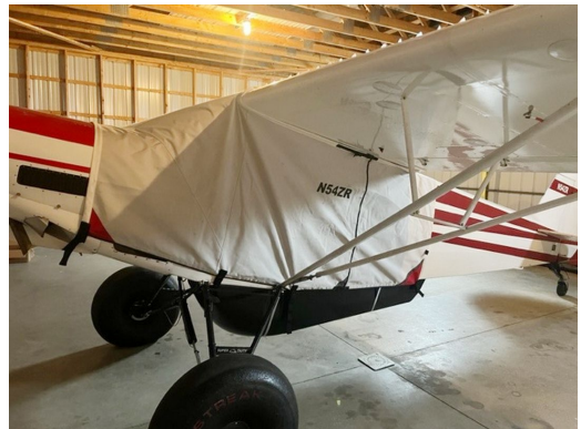
Piper PA-11 Extended Canopy Cover, Over the Top Style