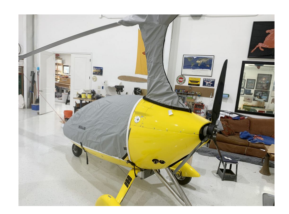
Autogyro Calidus Gyrocopter Canopy/Nose & Rotor Hub/Mast Cover

Rotor Hub Covers overlaps with the Blade Covers to ensure complete protection for the entire main rotor system. Designed like a jacket with sleeves and no collar, the rotor hub cover fastens together below each blade with Delrin buckles. The Rotor Hub Cover is normally made from Solution-Dyed Polyester.