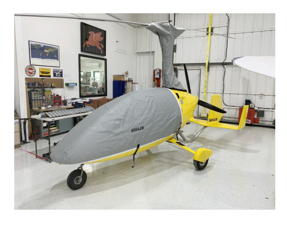
Autogyro Calidus Gyrocopter Canopy/Nose & Rotor Hub/Mast Cover