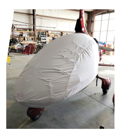
Cavalon Gyrocopter Bubble Cover, test fit cover