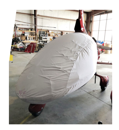
Cavalon Gyrocopter Bubble Cover, test fit cover