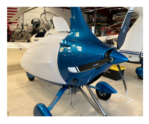
Autogyro Calidus Canopy/Nose Cover, test fit cover