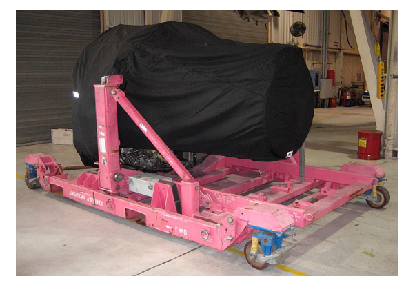
Cone, fully enclosed