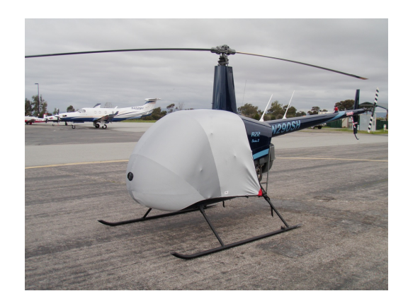
Robinson R-22 Light Weight Travel Cover