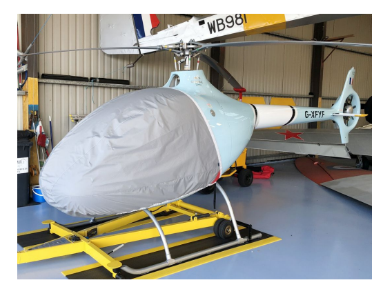
Cabri G2 Light Weight Travel Bubble Cover