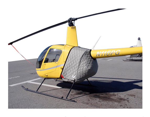
Robinson R-22 Insulated Engine Cover (also covers bottom) & Front Blade Tie-down