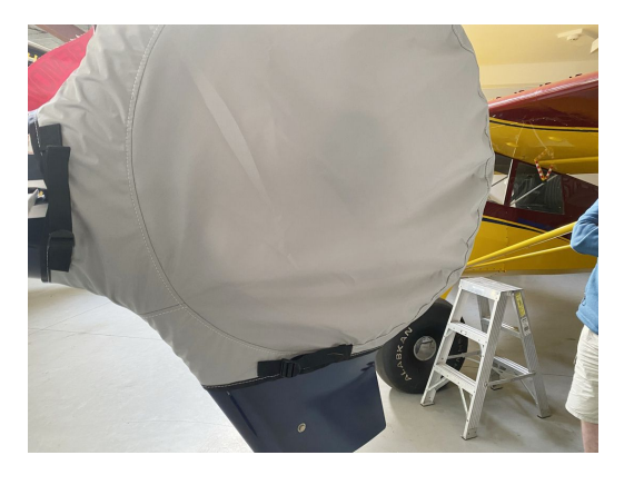
Guimbal Cabri G2 Tailfan Housing Fenestron Cover