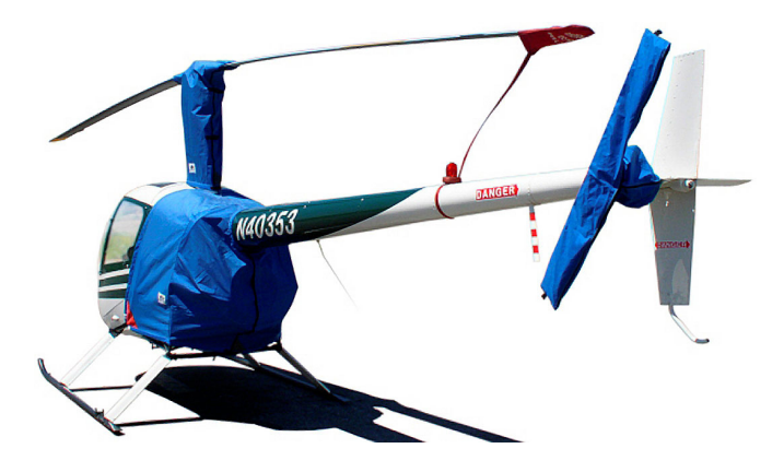
Robinson R-22 Engine, Rotor Mast & Tail Rotor Covers, with Blade Tie-down