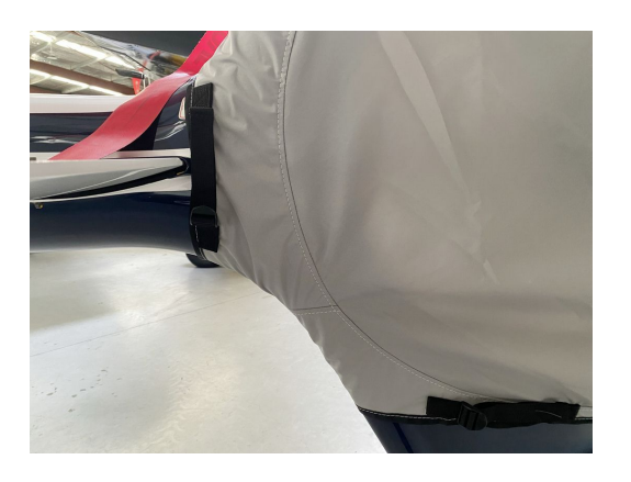
Guimbal Cabri G2 Tailfan Housing Fenestron Cover