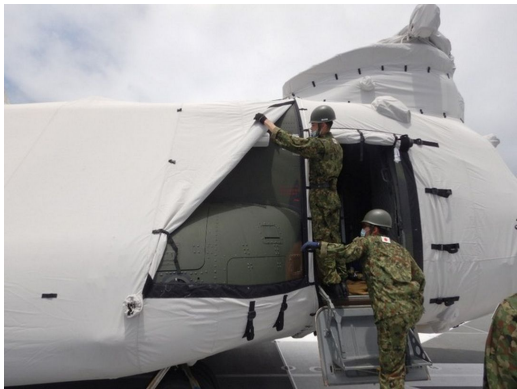
Boeing CH-47 Complete Body Cover

water resistance, UV resistance and anti-static buildup. The inner lining is a very soft and smooth microfiber to prevent scratching. The material is very reflective, and tests show that the cabin interior temperature can be reduced to near-ambient temperature on the hottest of days. It is water, ice and snow repellent, yet breathable to allow moisture to escape from between the cover and the aircraft surface.