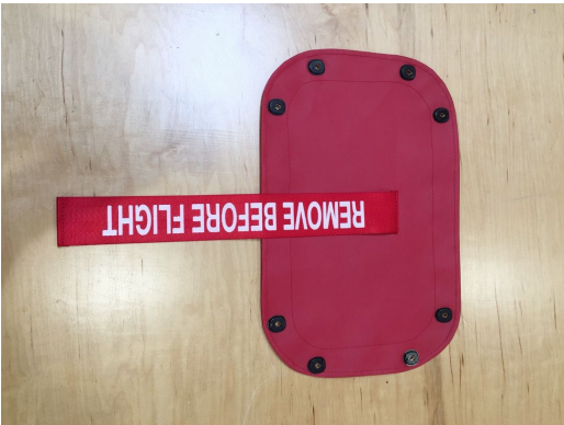
Boeing Vertol CH-47 Chinook Forward Pylon Side Inlet Snap Covers

shutdown. If you operate your aircraft in cold-weather, these covers will help prevent engine wear and tear.