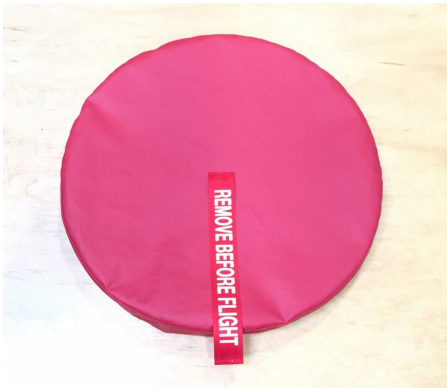
Boeing Vertol CH-47 Chinook Engine Exhaust Covers