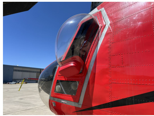
CH-47 Logger Window Plug