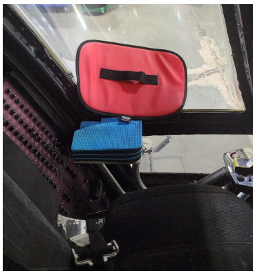
Boeing Vertol CH-47 Logger Window Plug