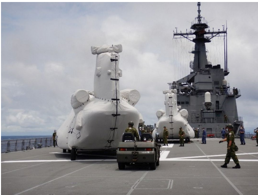
Boeing CH-47 Complete Body Cover