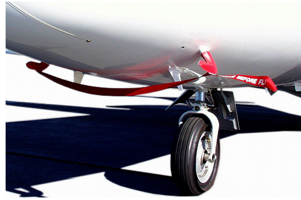
Cessna Citation I Pitot Covers