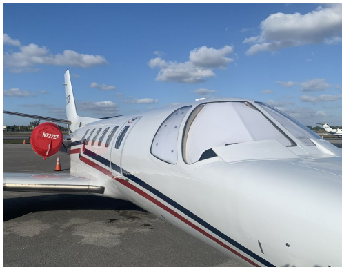
Cessna Citation S550

Custom-made Heatshield Sunshades are available for almost any window in the jet. Side windows, Skylights, and Emergency Exits are all custom-made. The product is a unique composite of closed-cell foam with a silver mylar finish. The set is easily stored in the included storage sleeve. Some designs may require velcro and suction cups. Our Heatshields are offered white side out since aircraft manufacturers have issued advisories against reflective window inserts due to potential heat damage.