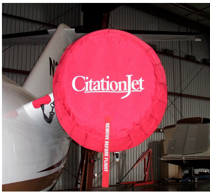
Cessna Citation Engine Cover Set