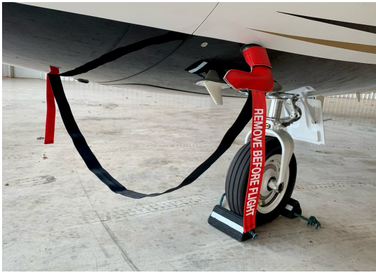
Cessna Citationjet CJ1 Pitot Cover Set