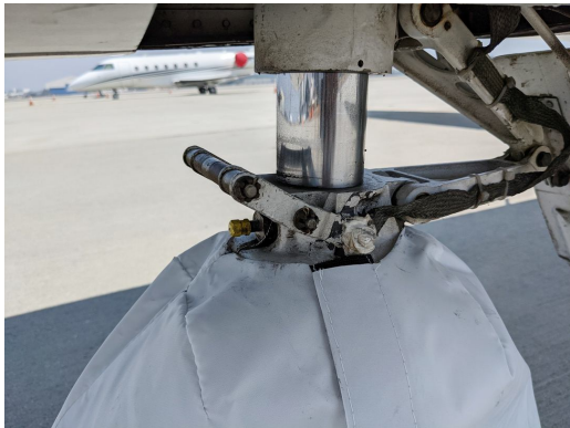
CJ1 Nose Gear Tire Cover, test fit

ALL-YEAR USE MATERIAL - Made with Silver Acrylic Sunbrella canvas, the all-year use material is the best option for sun protection and cover longevity. This heavier more durable material is intended for all weather conditions, such as rain and snow or lots of sun.