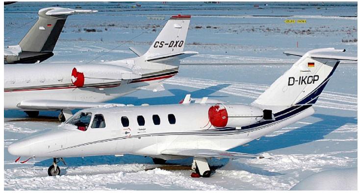
Engine Inlet Covers