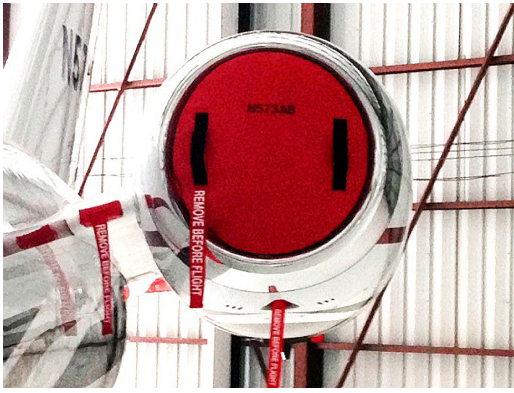
Citation CJ4 Intake Plugs pair