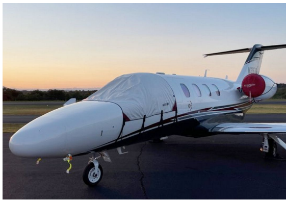
Cessna Citation Jet 525 Cockpit Cover