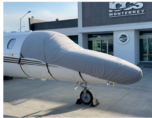
Citation CJ4 Cockpit/Nose Cover and Heat Resistant Pitot Covers set Cessna Citationjet 525B Travel Weight Cockpit/Nose Cover