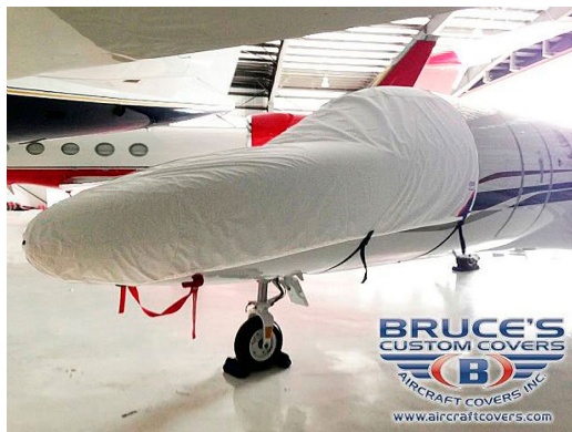
Citation CJ4 Cockpit/Nose Cover and Heat Resistant Pitot Covers set

Travel Covers are made with Silver Solution-Dyed Polyester fabric and only lined over the windshield to save weight. The material is lightweight and more compact for easy stowage in the aircraft. The polyester material is water resistant, but only intended for occasional use outside. We also have an ultra lightweight material available for fitted hangar dust covers. For daily outdoor use, the non-travel Sunbrella Cover is the best choice.