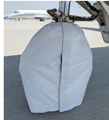
CJ1 Nose Gear Tire Cover, test fit