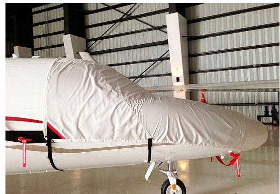
Citation CJ4 Cockpit/Nose Cover and Heat Resistant Pitot Covers set