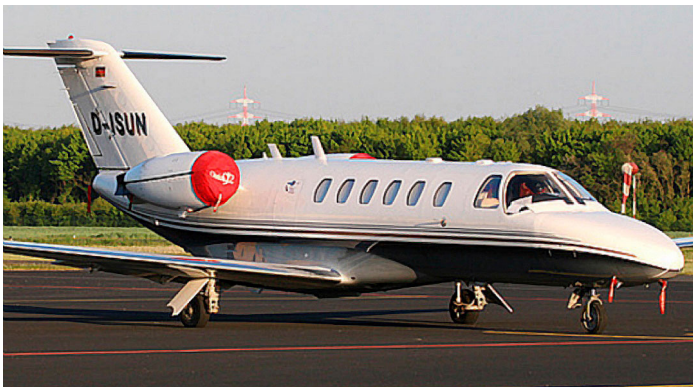
Engine Inlet/Exhaust Covers

The Cessna Citationjet 525A, CJ-2, & CJ2+ Intake/Exhaust Plugs are custom fit for the intake and exhaust openings, made with heavy-duty vinyl material, and stuffed with a single block of sculpted urethane foam. Each plug has a zipper that allows the foam to be removed and dried if necessary. Engine plugs have 'remove before flight' streamers sewn onto the face of the plugs. Most plugs are imprinted with the aircraft registration number in black. Engine plugs may be inserted after flight when the engine is still warm. Engine Inlet Plugs are commonly referred to as Cowl Plugs, Intake Plugs, Cowl Blocks, Engine Blocks, and Engine Bungs.