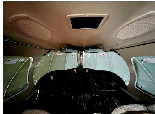
Cessna 525A Cockpit heatshields