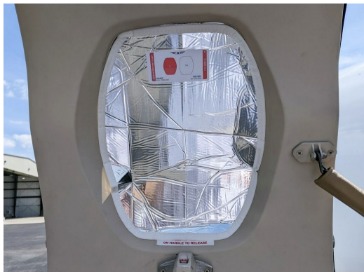
Citationjet Entrance Door Heatshield

Custom-made Heatshield Sunshades are available for almost any window in the jet. Side windows, Skylights, and Emergency Exits are all custom-made. The product is a unique composite of closed-cell foam with a silver mylar finish. The set is easily stored in the included storage sleeve. Some designs may require velcro and suction cups. Our Heatshields are offered white side out since aircraft manufacturers have issued advisories against reflective window inserts due to potential heat damage.