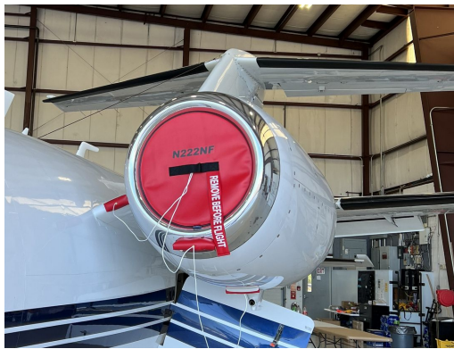
Cessna Citationjet 525A Intake Plugs Set

The Engine Inlet Plugs are custom fit for your Cessna Citationjet 525A, CJ-2, & CJ2+ intakes, made with heavy-duty vinyl material, and stuffed with a single block of sculpted urethane foam. Each plug has a zipper that allows the foam to be removed and dried if necessary. Engine plugs have 'remove before flight' streamers sewn onto the face of the plugs. Most plugs are imprinted with the aircraft registration number in black for an extra charge. Storage bag NOT included. Engine plugs may be inserted after flight when the engine is still warm. Engine Inlet Plugs are commonly referred to as Cowl Plugs, Intake Plugs, Cowl Blocks, Engine Blocks, and Engine Bungs.