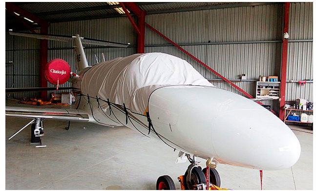
Citation CJ-1 Canopy Cover and Engine Covers