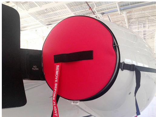
Cessna CJ1 Exhaust Plug

The Engine Inlet Plugs are custom fit for your Cessna Citationjet 525A, CJ-2, & CJ2+ intakes, made with heavy-duty vinyl material, and stuffed with a single block of sculpted urethane foam. Each plug has a zipper that allows the foam to be removed and dried if necessary. Engine plugs have 'remove before flight' streamers sewn onto the face of the plugs. Most plugs are imprinted with the aircraft registration number in black for an extra charge. Storage bag NOT included. Engine plugs may be inserted after flight when the engine is still warm. Engine Inlet Plugs are commonly referred to as Cowl Plugs, Intake Plugs, Cowl Blocks, Engine Blocks, and Engine Bungs.