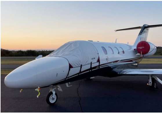
Cessna Citation Jet 525 Cockpit Cover