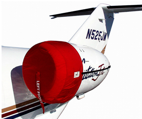
Engine Inlet Cover

The Cessna Citationjet 525A, CJ-2, & CJ2+ Intake/Exhaust Plugs are custom fit for the intake and exhaust openings, made with heavy-duty vinyl material, and stuffed with a single block of sculpted urethane foam. Each plug has a zipper that allows the foam to be removed and dried if necessary. Engine plugs have 'remove before flight' streamers sewn onto the face of the plugs. Most plugs are imprinted with the aircraft registration number in black. Engine plugs may be inserted after flight when the engine is still warm. Engine Inlet Plugs are commonly referred to as Cowl Plugs, Intake Plugs, Cowl Blocks, Engine Blocks, and Engine Bungs.