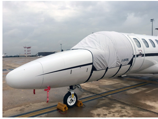
Cessna Citationjet 525A, CJ-2, & CJ2+ Cockpit Cover