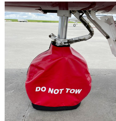
Citationjet CJ-3 Nose Gear Tire Cover