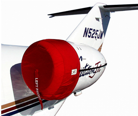
Engine Inlet Cover