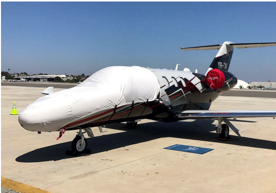
Citationjet CJ1 Cockpit/Nose Cover

This cover type is made from Silver Acrylic Sunbrella canvas and is 100% lined with a soft and smooth microfiber. Bruce's Custom Covers developed this material combination especially for aircraft protection. The outer material is medium weight and treated for water resistance, UV resistance and anti-static buildup. The inner lining is a very soft and smooth microfiber to prevent scratching. The material is very reflective, and tests show that the cabin interior temperature can be reduced to near-ambient temperature on the hottest of days. It is water, ice and snow repellent, yet breathable to allow moisture to escape from between the cover and the aircraft surface.