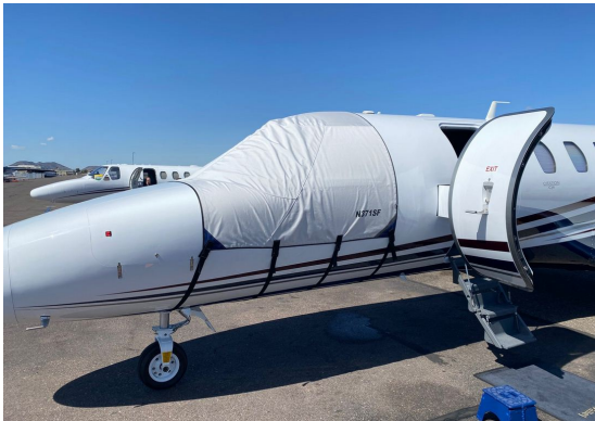
Citationjet 525C Cockpit Cover