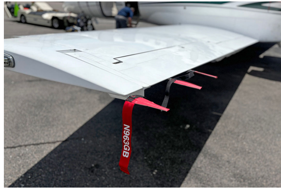
Cessna Citationjet 525C, CJ-4 Static Wick Protectors, 3 Per Wing, 1 On Tailcone Area