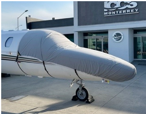
Cessna Citationjet 525B Travel Weight Cockpit/Nose Cover

This cover type is made from Silver Acrylic Sunbrella canvas and is 100% lined with a soft and smooth microfiber. Bruce's Custom Covers developed this material combination especially for aircraft protection. The outer material is medium weight and treated for water resistance, UV resistance and anti-static buildup. The inner lining is a very soft and smooth microfiber to prevent scratching. The material is very reflective, and tests show that the cabin interior temperature can be reduced to near-ambient temperature on the hottest of days. It is water, ice and snow repellent, yet breathable to allow moisture to escape from between the cover and the aircraft surface.