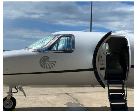
Cessna Citationjet CJ2 Cockpit HeatShields