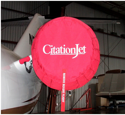
Cessna Citation Engine Cover Set