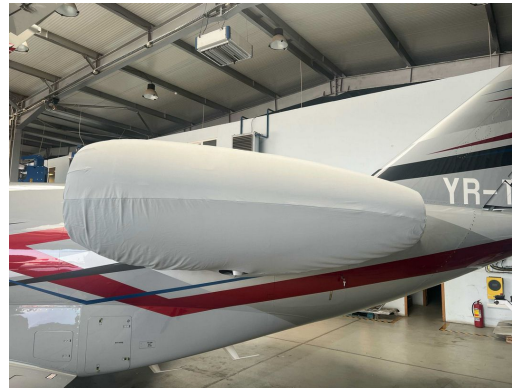
Citationjet 525C, CJ4, Complete Nacelle Cover, light weight Spandex