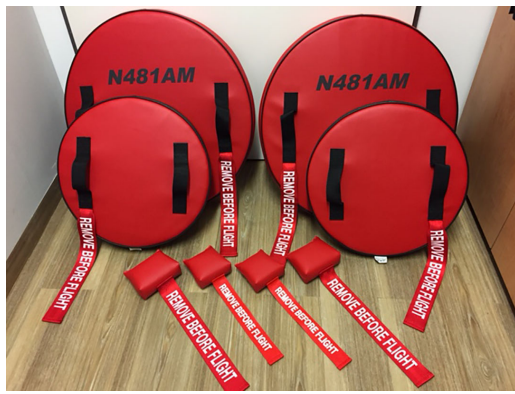
Citation CJ4 Complete Plug Set