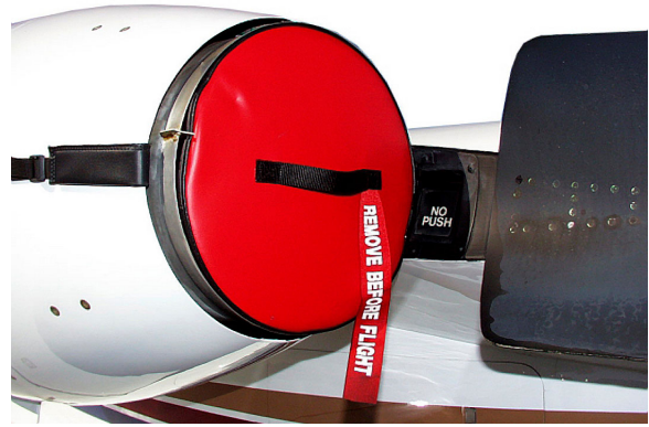
Engine Exhaust Plug