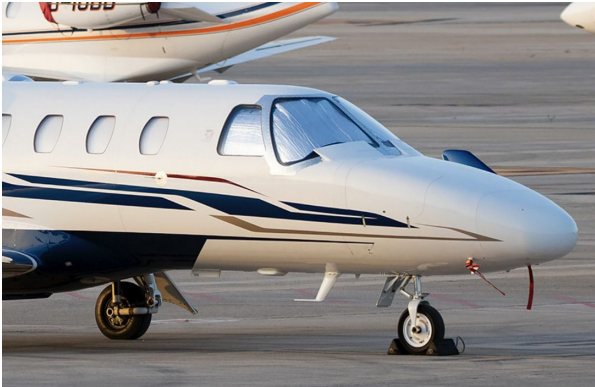
Cessna Citationjet 525, CJ-I, CJ1+, & M2 Cockpit Heatshields