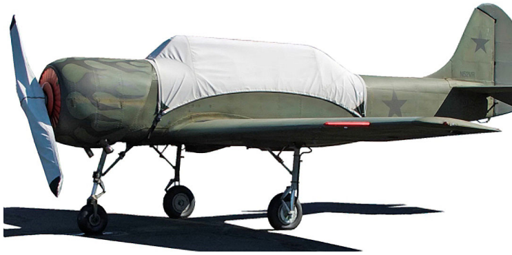
Yak 52 Canopy Cover & Prop Cover