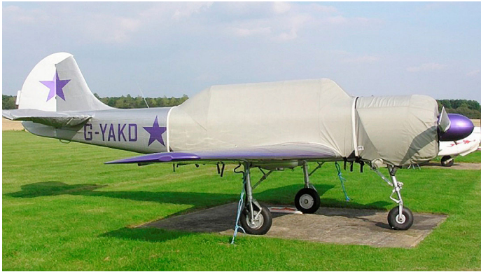
Yak 52 Extended Canopy, Engine & Horiz. Stab. Covers