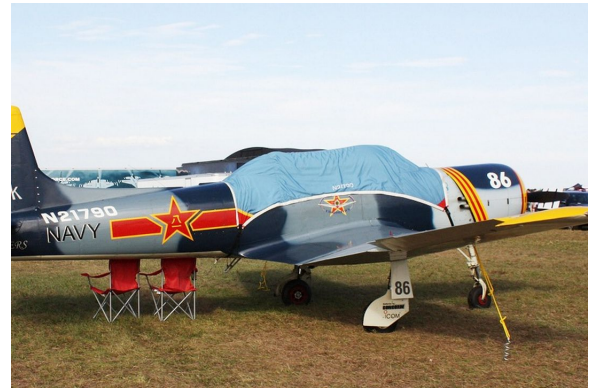
Malcomb Hood cover for a CJ-6