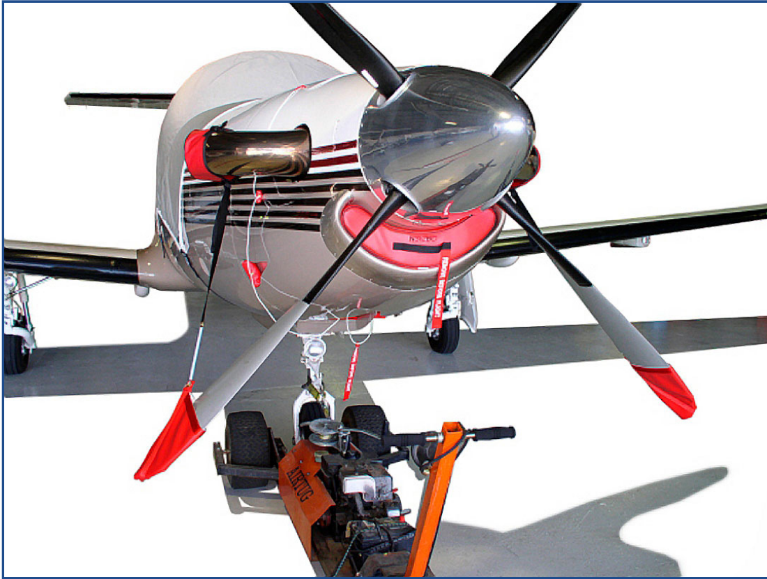
Pilatus PC-12 LARGE ENGINE INLET PLUG, SMALL PLUGS SET, Prop Tie/Exhaust Covers