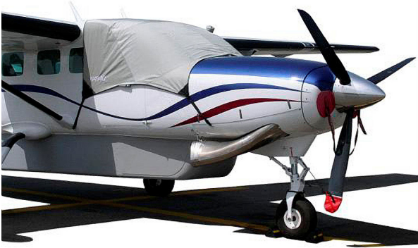
Cessna Caravan Cockpit Cover, Plugs, Prop Ties & Pitot Cover

water resistance, UV resistance and anti-static buildup. The inner lining is a very soft and smooth microfiber to prevent scratching. The material is very reflective, and tests show that the cabin interior temperature can be reduced to near-ambient temperature on the hottest of days. It is water, ice and snow repellent, yet breathable to allow moisture to escape from between the cover and the aircraft surface.