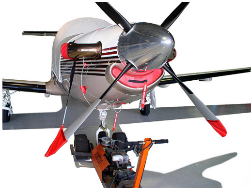
Pilatus PC-12 LARGE ENGINE INLET PLUG, SMALL PLUGS SET, Prop Tie/Exhaust Covers

water resistance, UV resistance and anti-static buildup. The inner lining is a very soft and smooth microfiber to prevent scratching. The material is very reflective, and tests show that the cabin interior temperature can be reduced to near-ambient temperature on the hottest of days. It is water, ice and snow repellent, yet breathable to allow moisture to escape from between the cover and the aircraft surface.